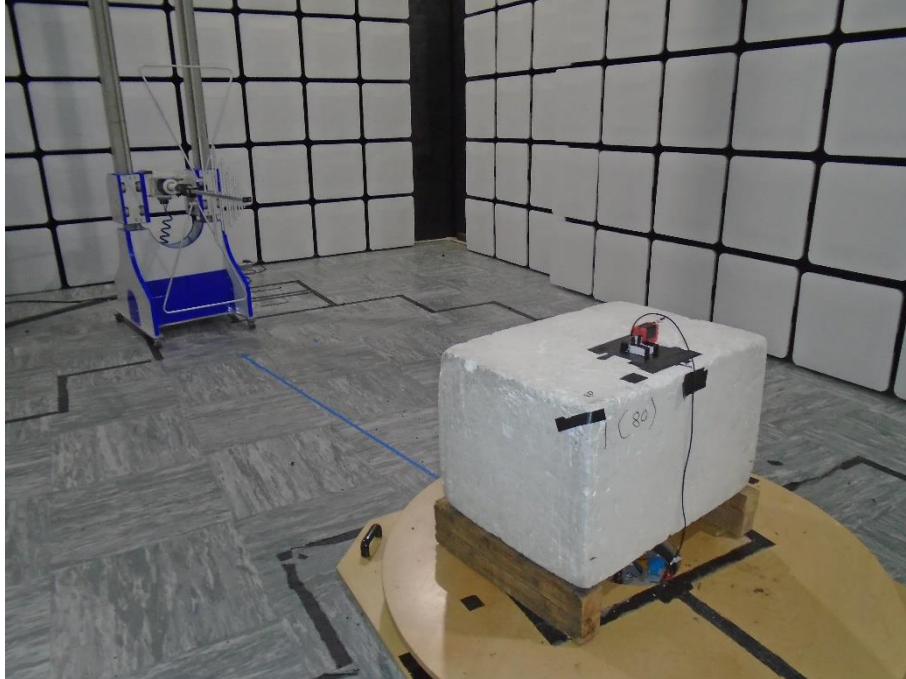
Figure 1 – Radiated Disturbance - 30 MHz to 1 GHz