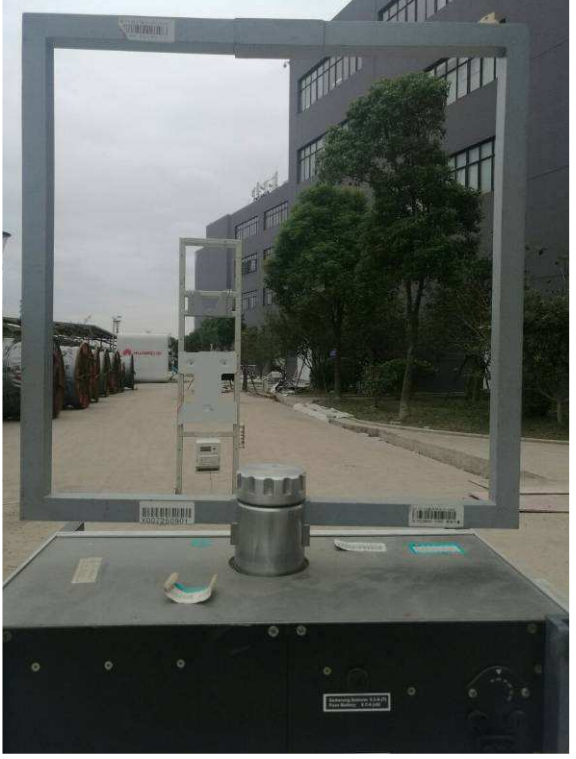
Underground, Location 3, higher than 30MHz