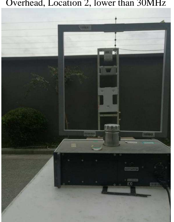
Overhead, Location 2, lower than 30MHz