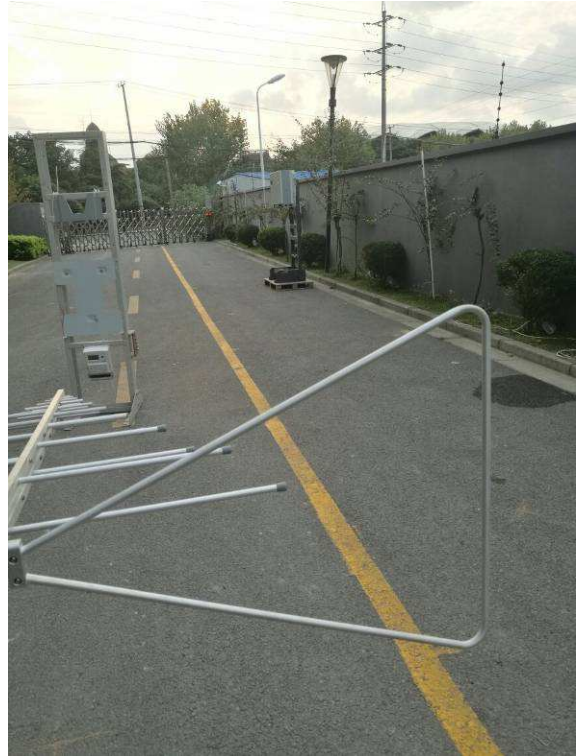
Underground, Location 1, higher than 30MHz