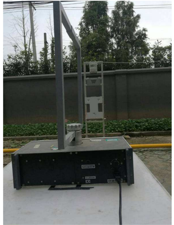
Overhead, Location 3, lower than 30MHz