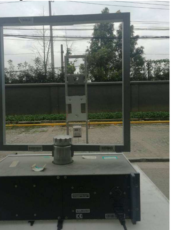
Underground, Location 2, higher than 30MHz