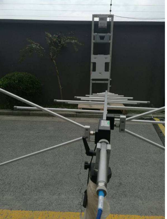
Overhead, Location 2, higher than 30MHz