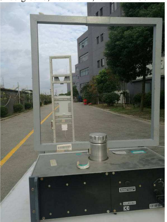
Underground, Location 1, lower than 30MHz