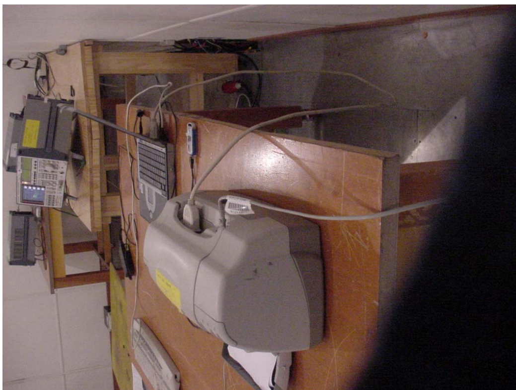
<SIDE PHOTO OF CONTINUOUS DISTURBANCE VALTAGE>