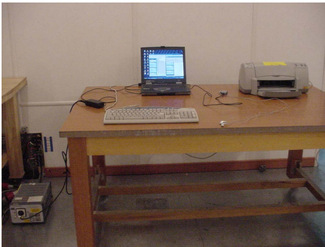
<FRONT PHOTO OF CONTINUOUS DISTURBANCE VOLATAGE>