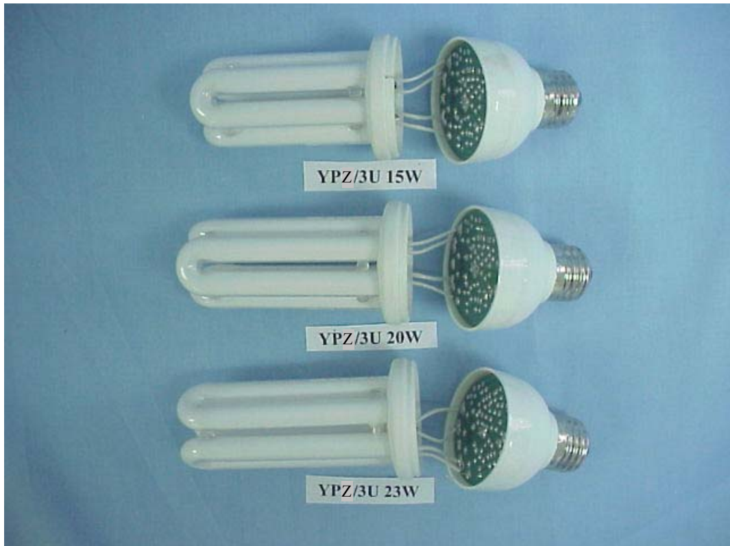
FIGURE 1 ENERGY SAVING LAMP (M/N: YPZ/3U 15W/20W/23W) COVER REMOVED