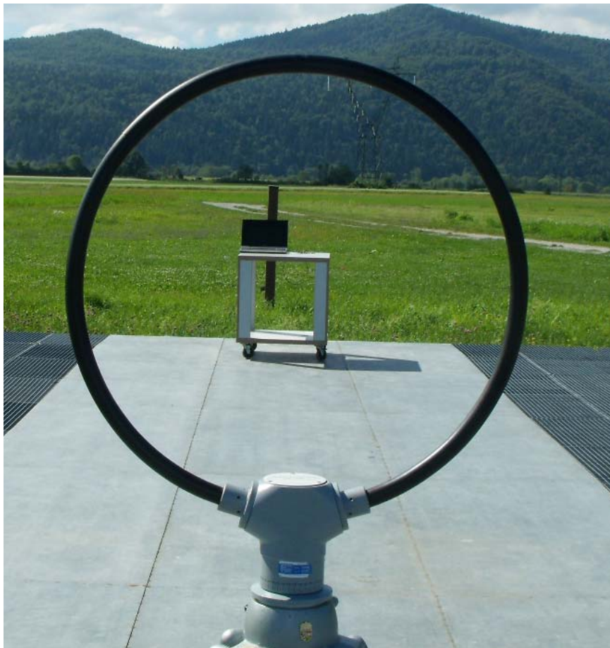
Figure 4: Radiated emission test – under 30 MHz on OATS