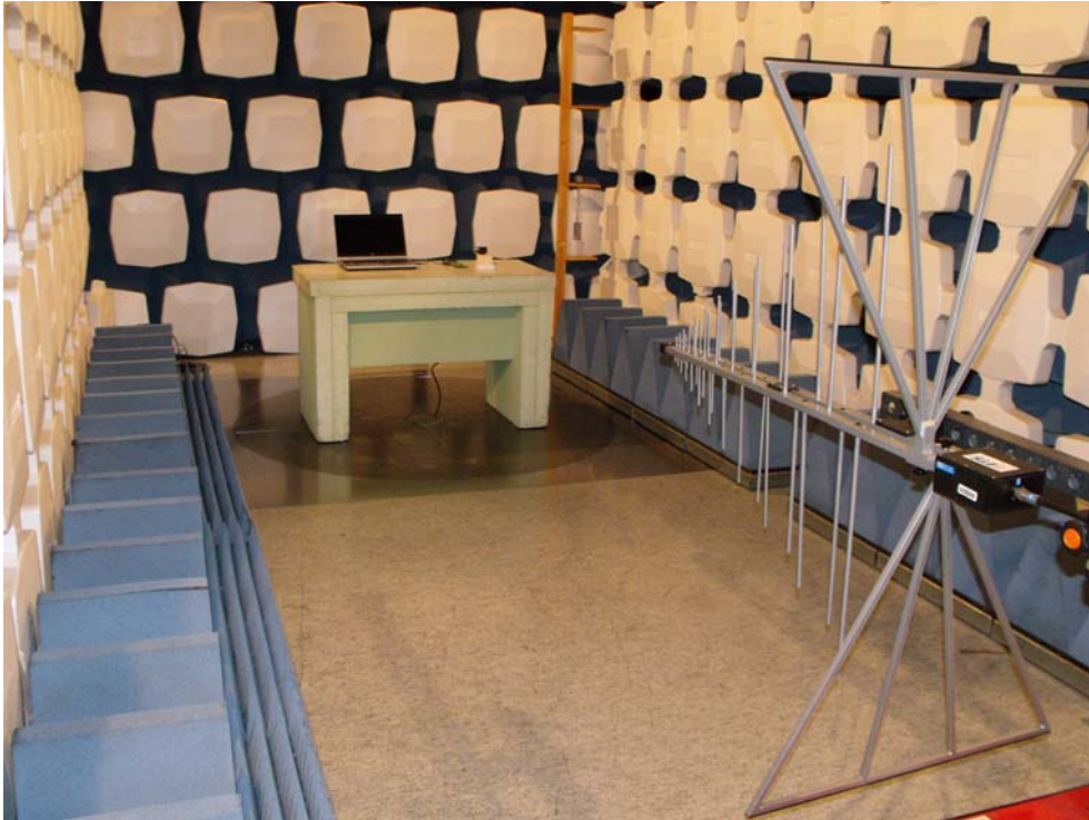
Figure 3: Radiated emission test – over 30 MHz