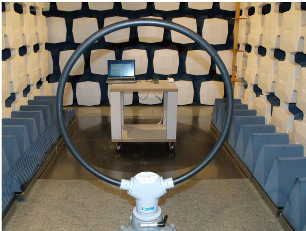
Figure 2: Radiated emission test – under 30 MHz