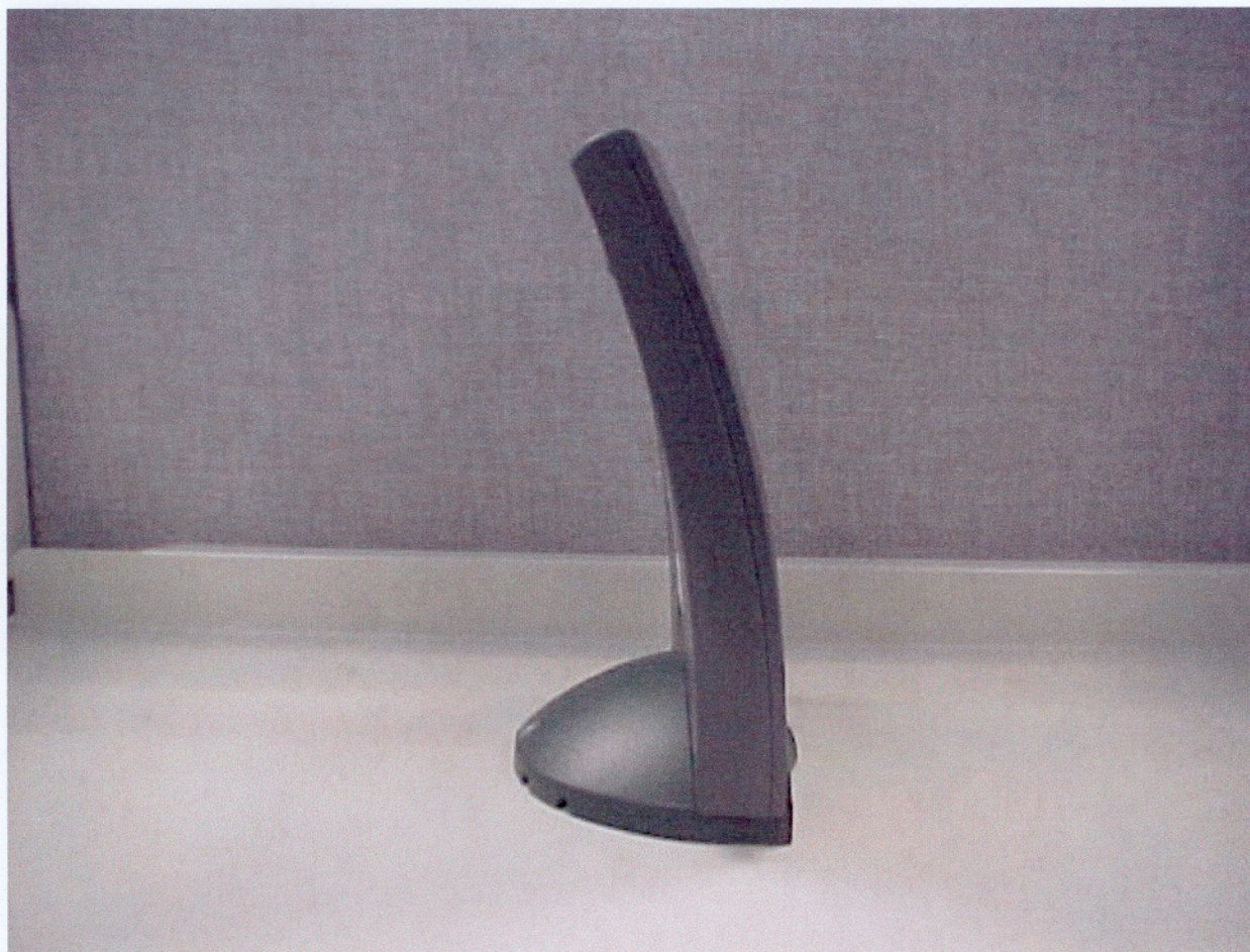
Side view of device.