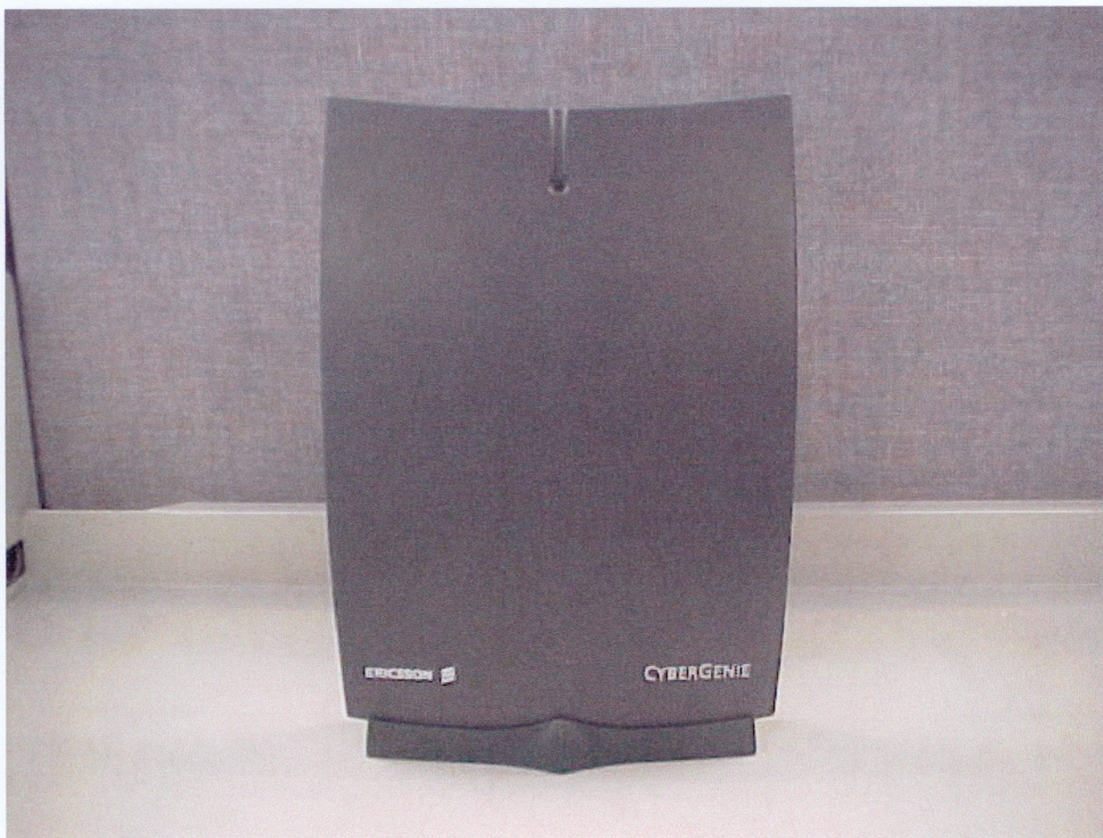
Front view of device.