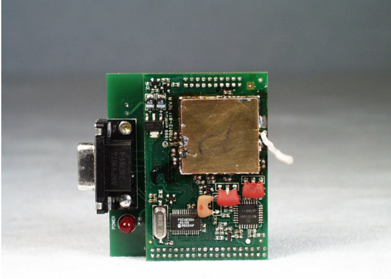
Front View of the EMRF900 with Interface Board