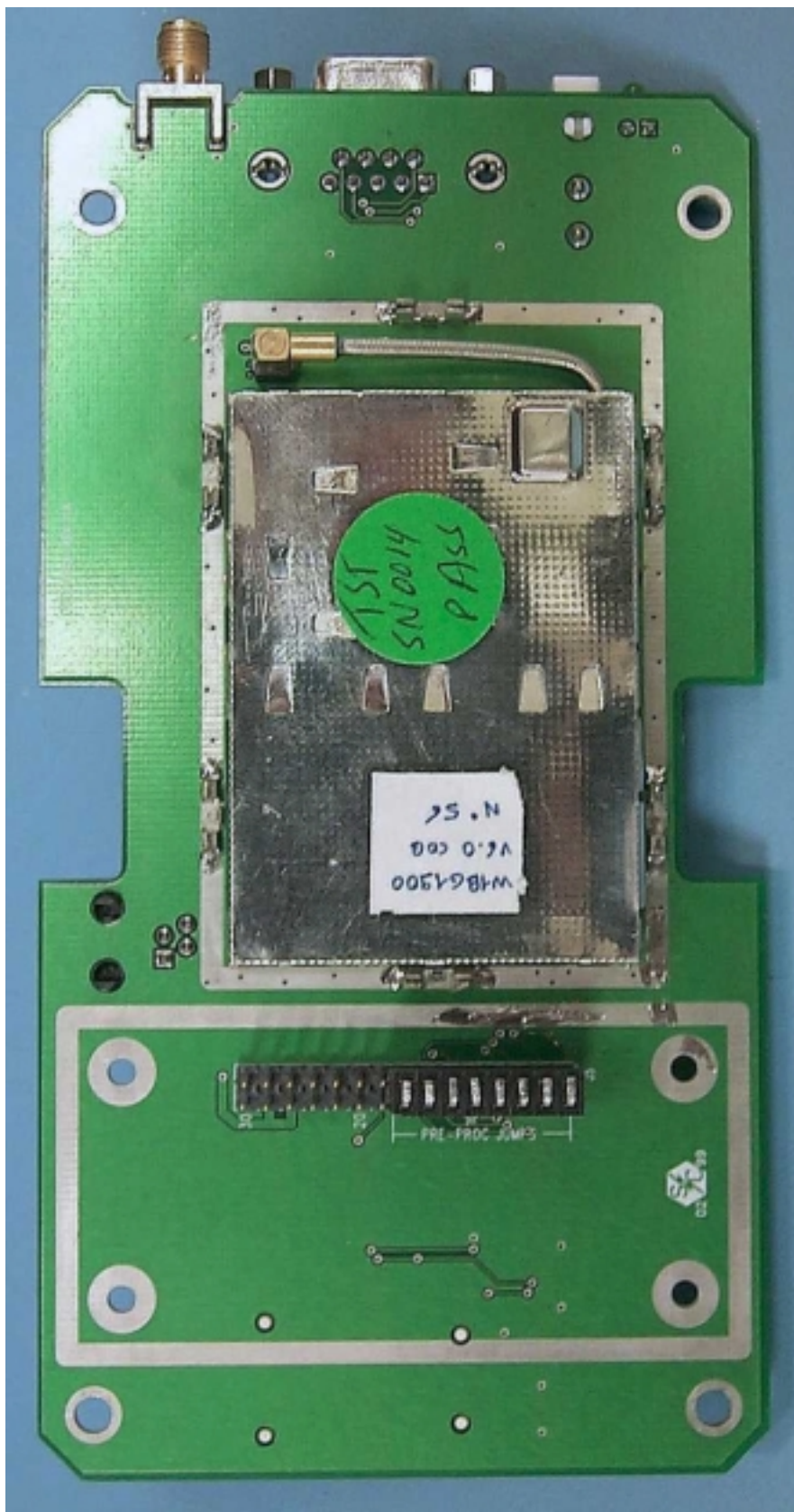
Photo 3. Bottom of DTSA PCB with shield covering GSM radio module removed.