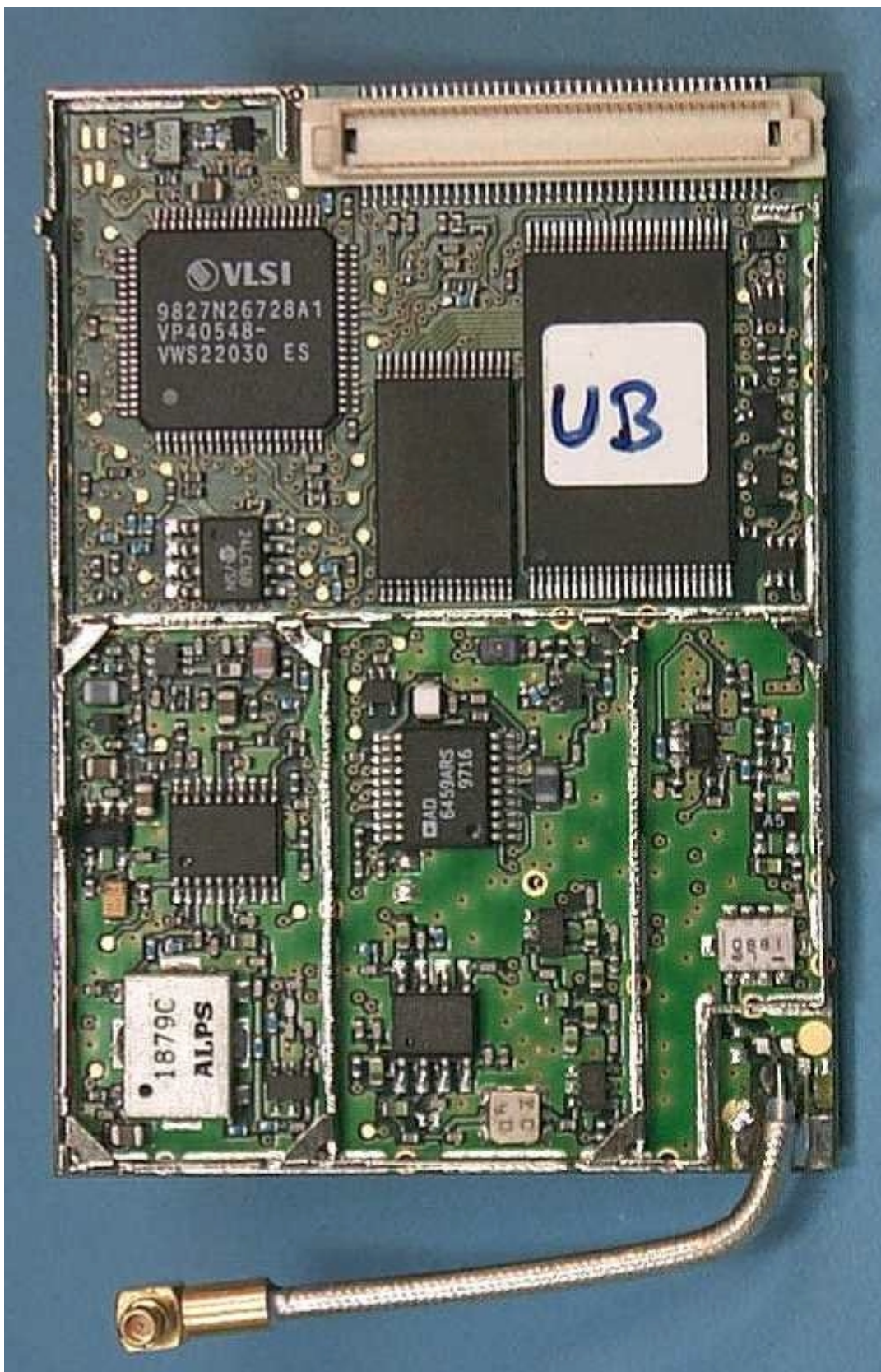
Photo 5. Bottom of GSM Radio Module.