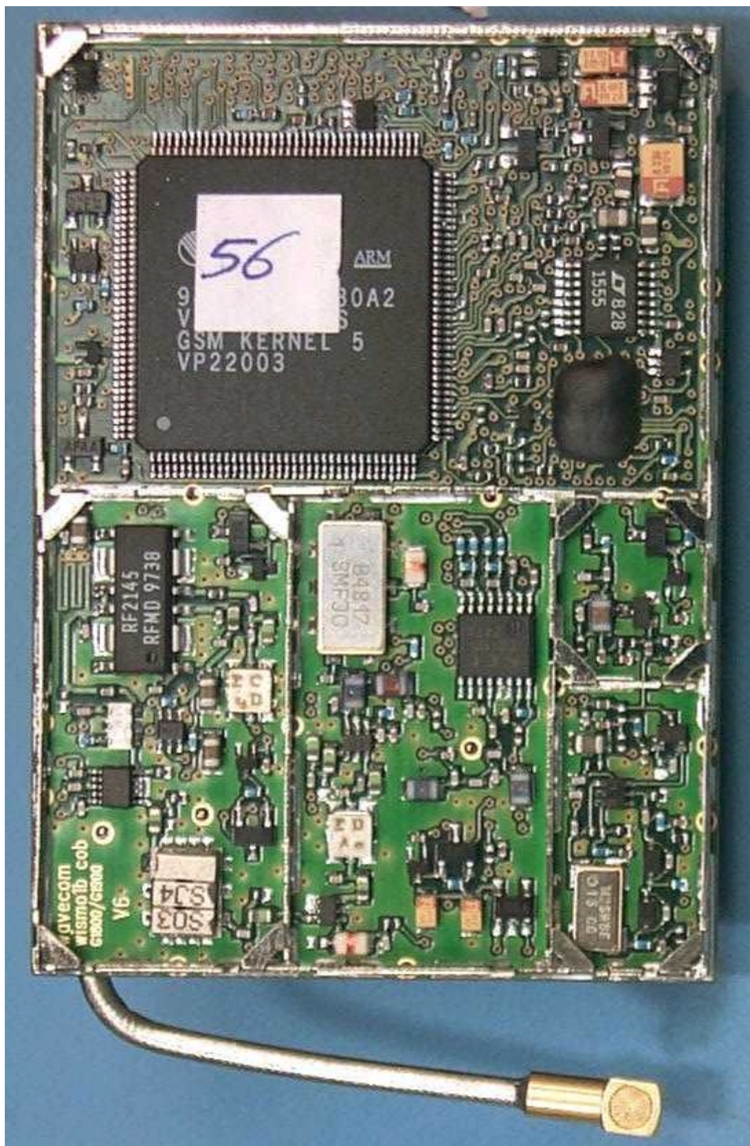
Photo 4. Top of GSM Radio Module.