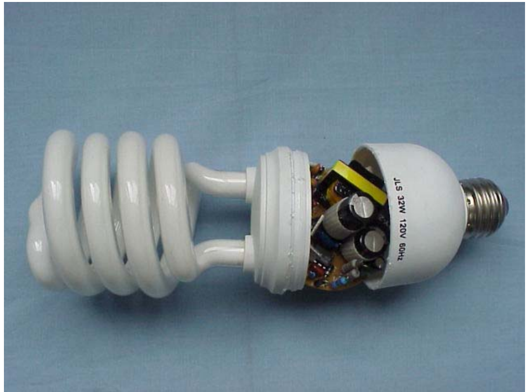
FIGURE 1 ENERGY SAVING LAMP (M/N: JLS 32W) COVER REMOVED