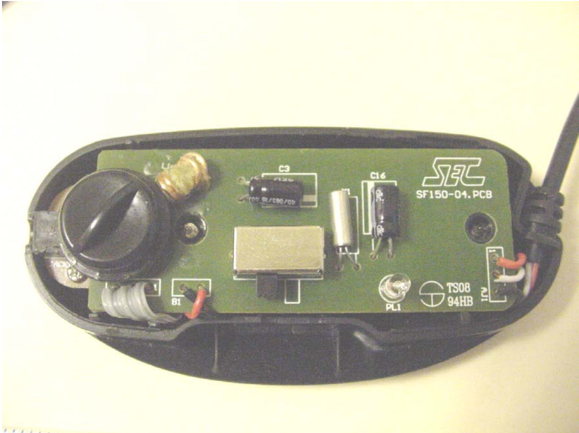
RF Board Top View