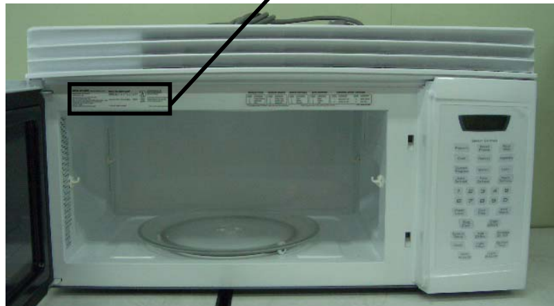
< Fig. 2. Photo of the physical location of the label >

* Alternate location: The nameplate may be alternatively affixed on the left side of control panel or internal surface of oven cavity or rear surface of oven.