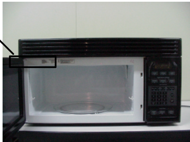
< Fig. 2. Photo of the physical location of the label>

* Alternate location: The nameplate may be alternatively affixed on the left side of control panel or internal surface of oven cavity.