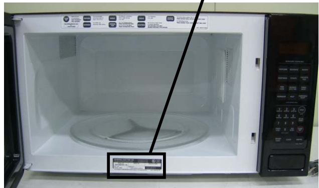
< Fig. 2. Photo of the physical location of the label>

* Alternate location: The nameplate may be alternatively affixed on the left side of control panel or internal surface of oven cavity or rear surface of oven.