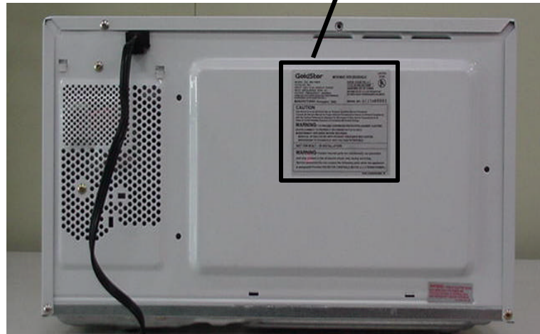
< Fig. 2. Photo of the physical location of the label>

* Alternate location: The nameplate may be alternatively affixed on the front surface of oven cavity or left side of con- trol panel.