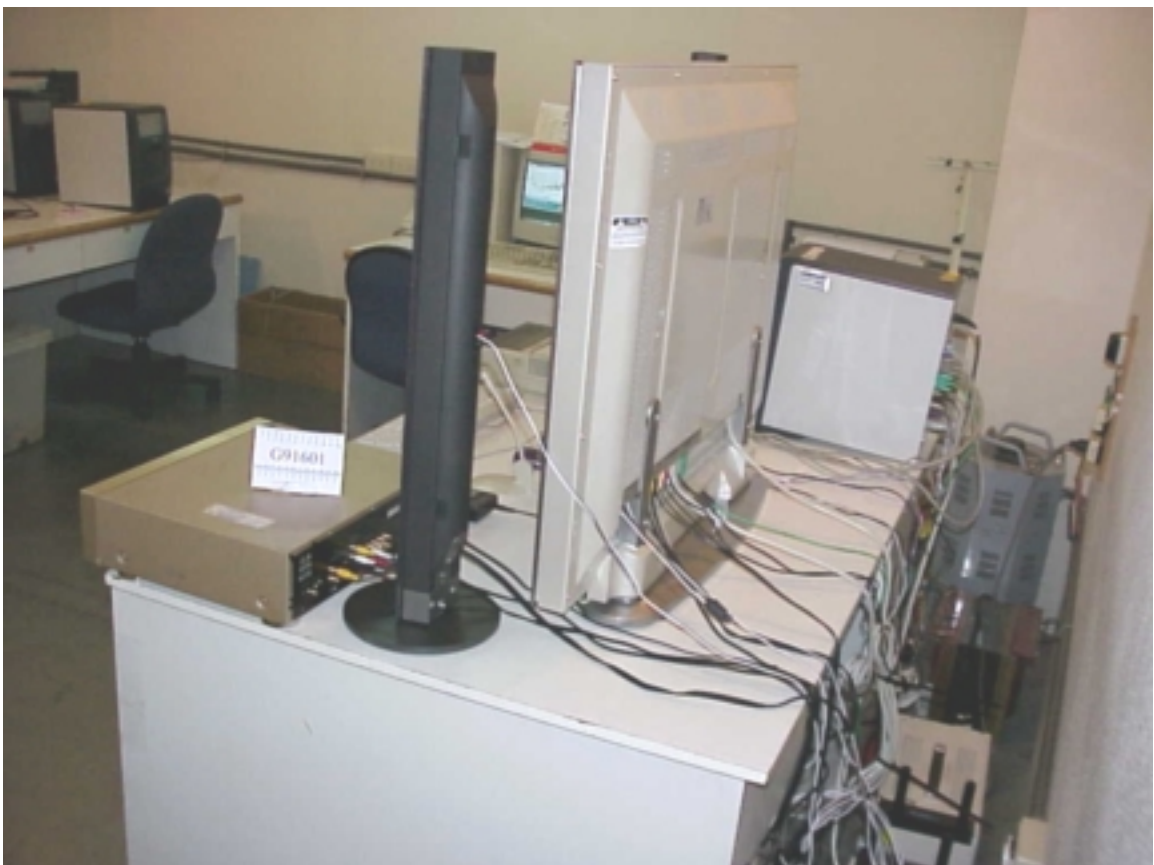
BACK VIEW OF CONDUCTED TEST