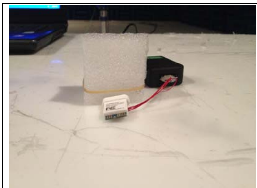
EUT Position: X-axis