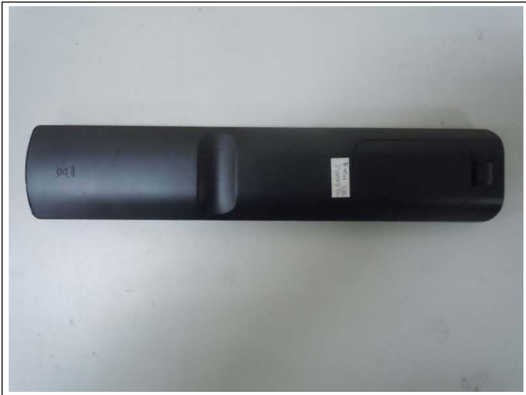
Remote Control Rear