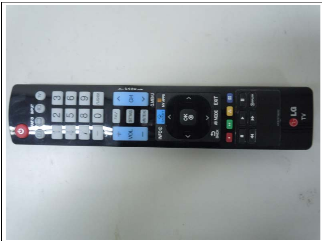
Remote Control Front