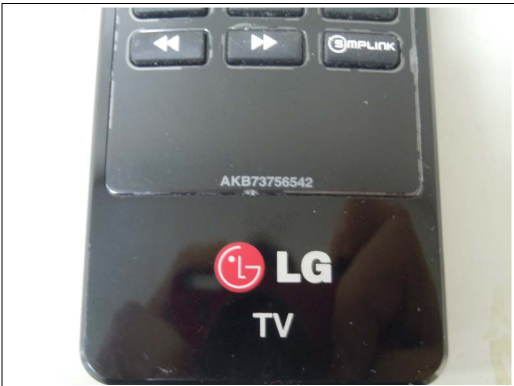
Remote Control Label