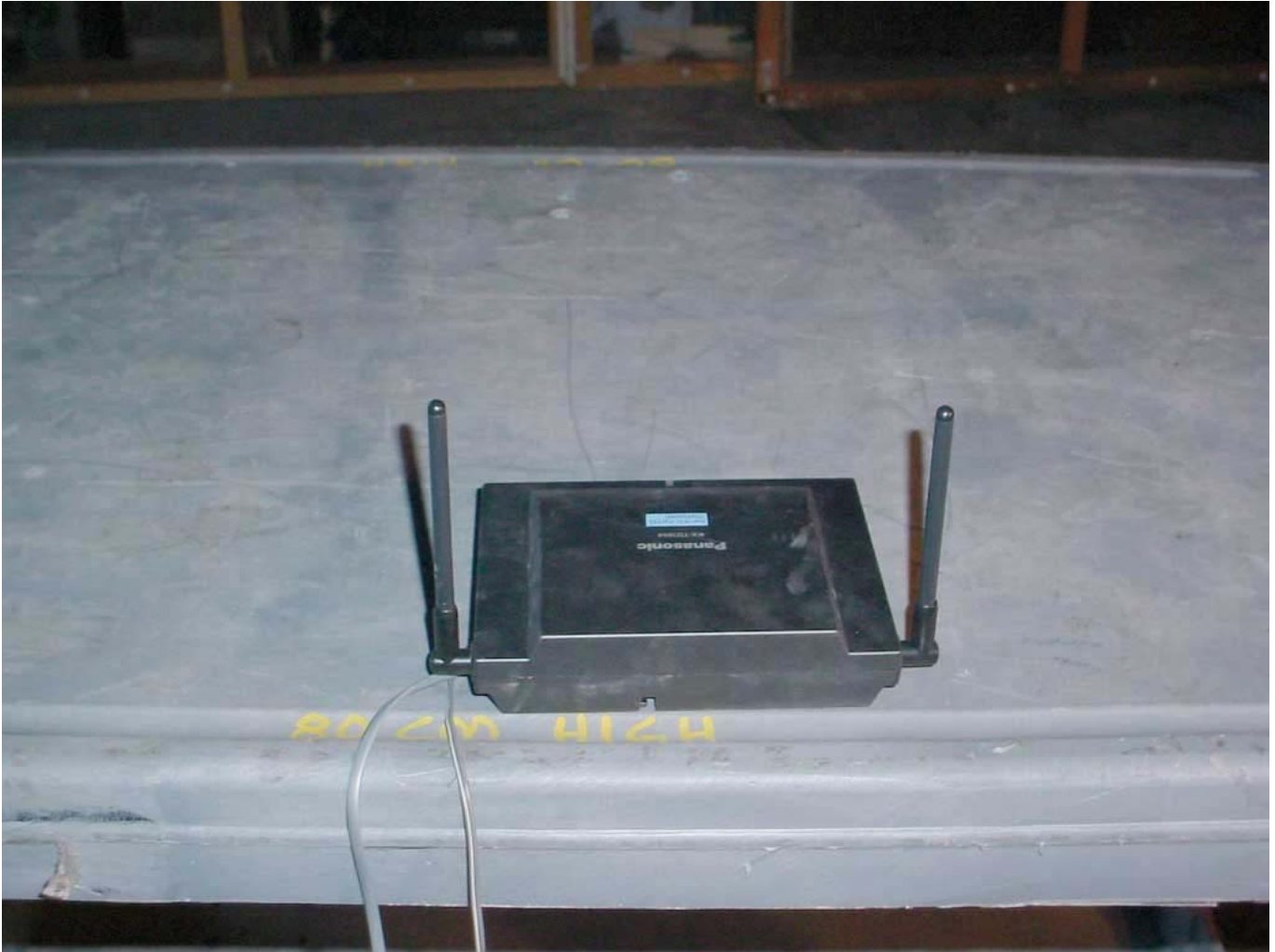
Transmitter/Receiver Radiated Emissions at 3 Meters Base Unit (Antenna perpendicular to ground plane)