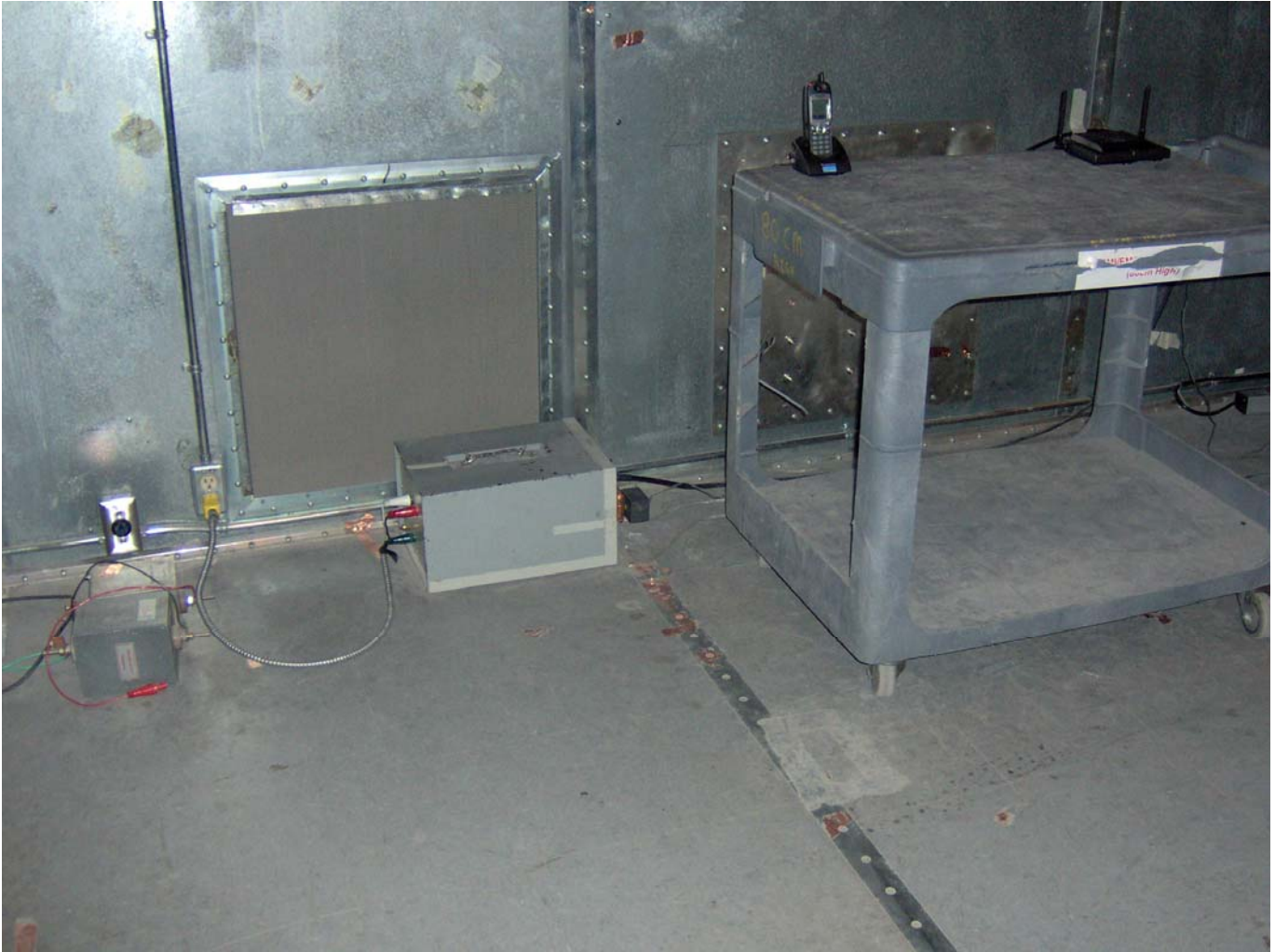
AC Power Line Conducted Emissions (Handset - Front View)