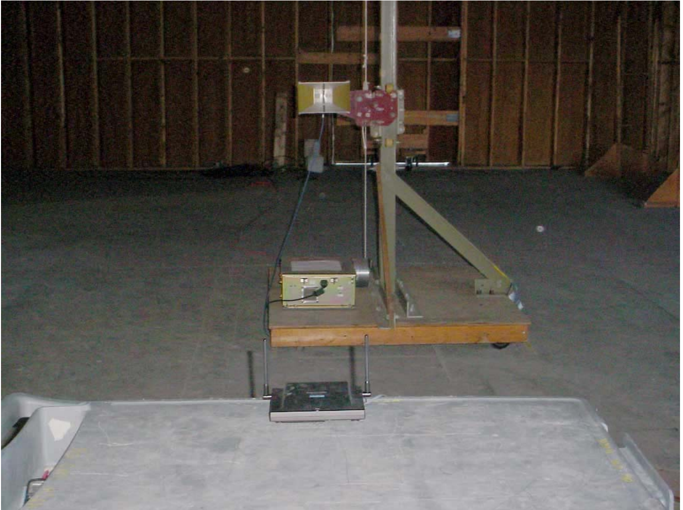
Transmitter/Receiver Radiated Emissions at 3 Meters Base Unit (Antenna perpendicular to ground plane)