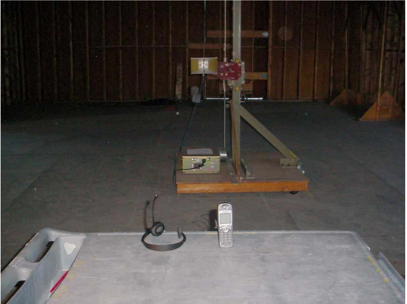
Transmitter/Receiver Radiated Emissions at 3 Meters Handset (Orthogonal position # 2)