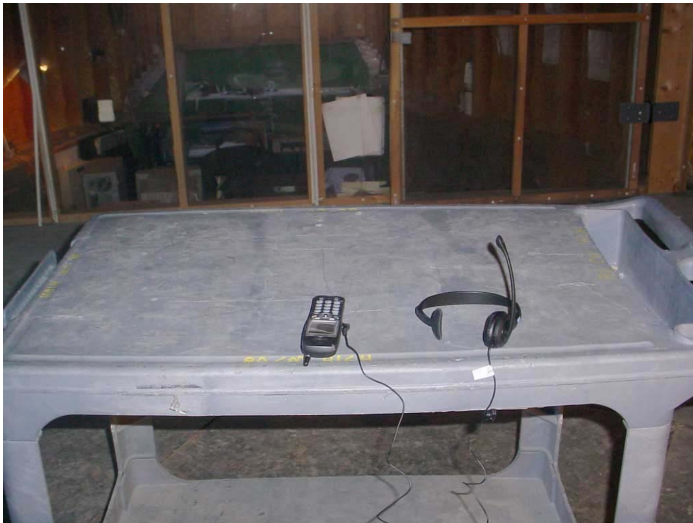
Transmitter/Receiver Radiated Emissions at 3 Meters Handset (Orthogonal Position # 1)