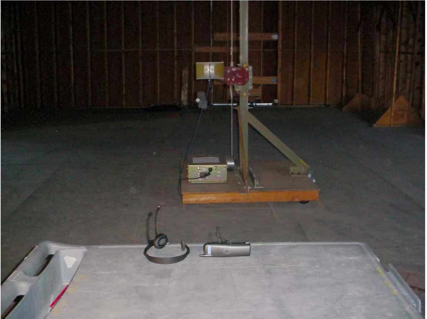
Transmitter/Receiver Radiated Emissions at 3 Meters Handset (Orthogonal position # 3)