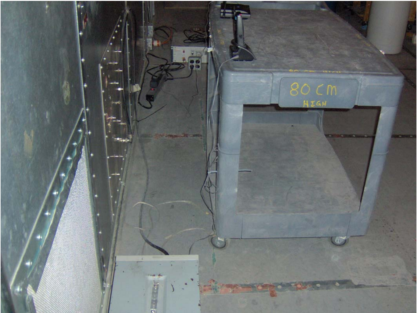
AC Power Line Conducted Emissions (Handset - Side View)