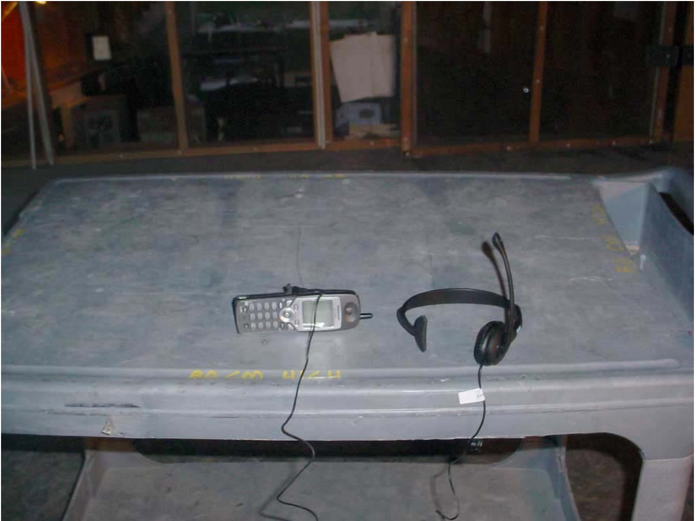
Transmitter/Receiver Radiated Emissions at 3 Meters Handset (Orthogonal position # 3)