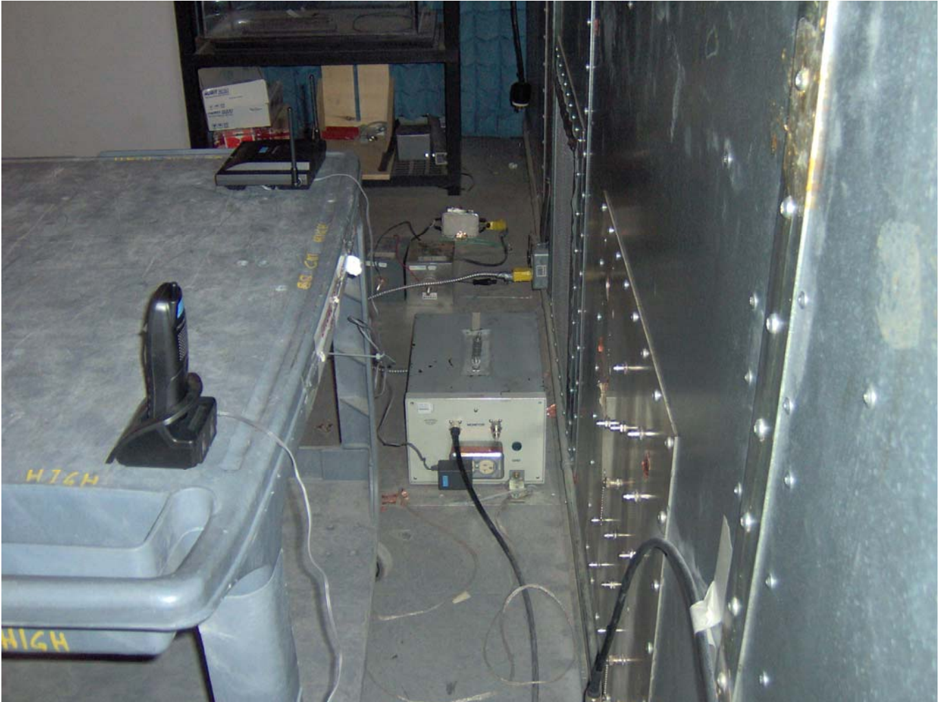
AC Power Line Conducted Emissions (Base Unit - Side View)