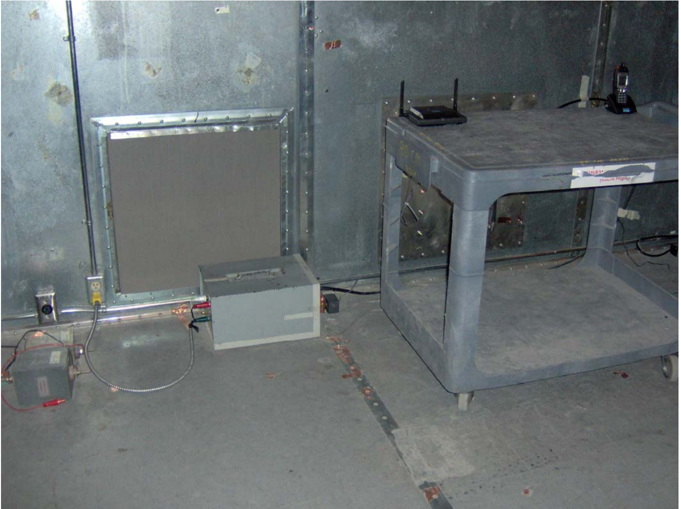
AC Power Line Conducted Emissions (Base Unit - Front View)