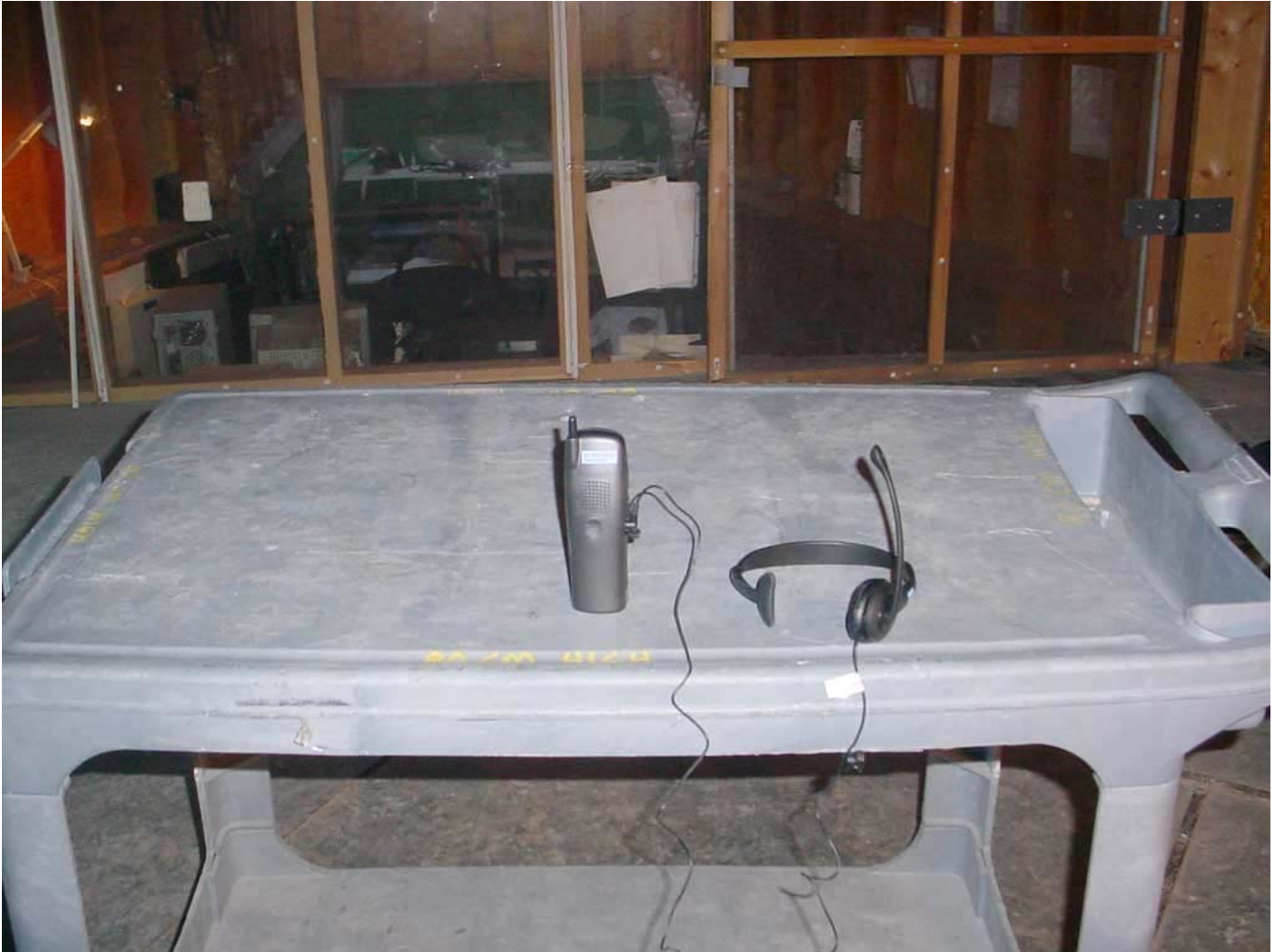
Transmitter/Receiver Radiated Emissions at 3 Meters Handset (Orthogonal position # 2)