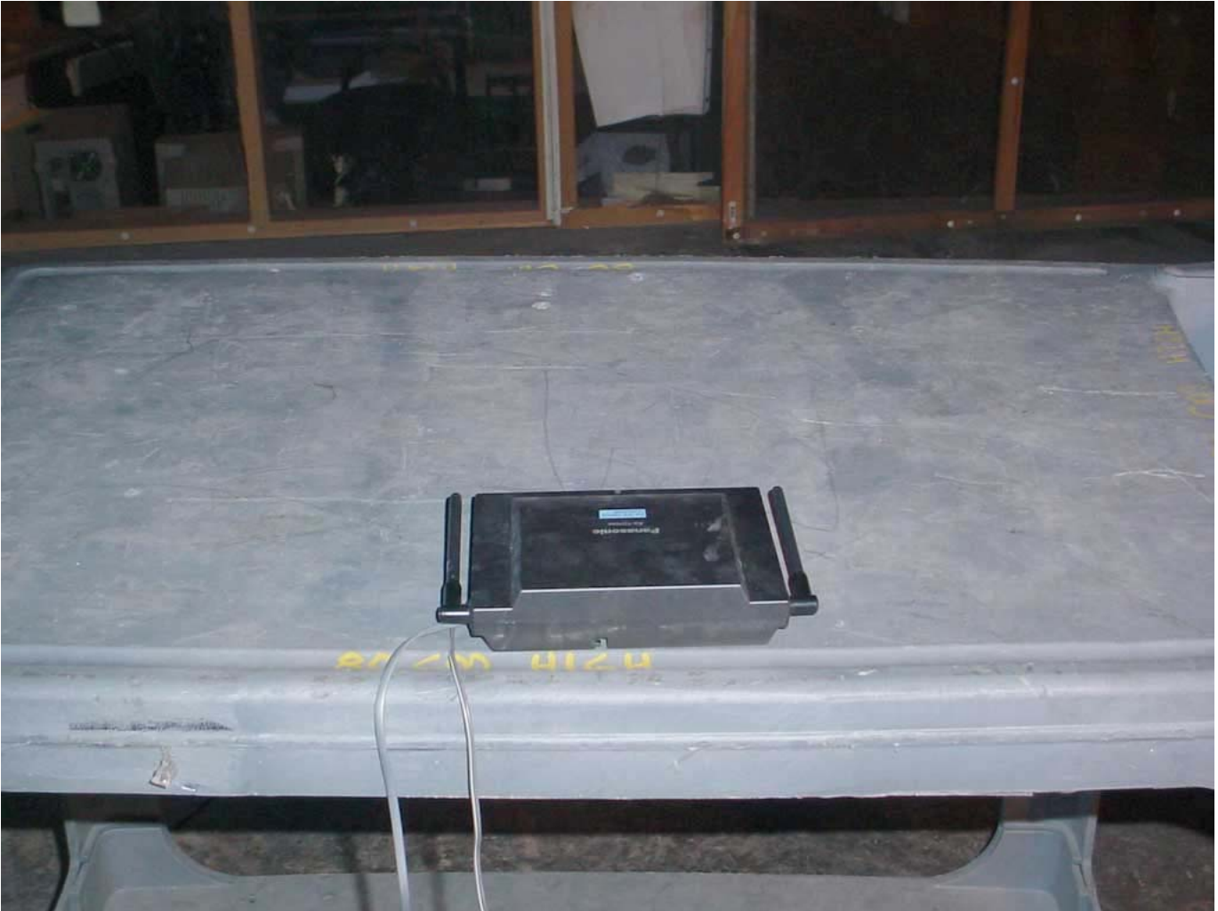
Transmitter/Receiver Radiated Emissions at 3 Meters Base Unit (Antenna parallel to ground plane)