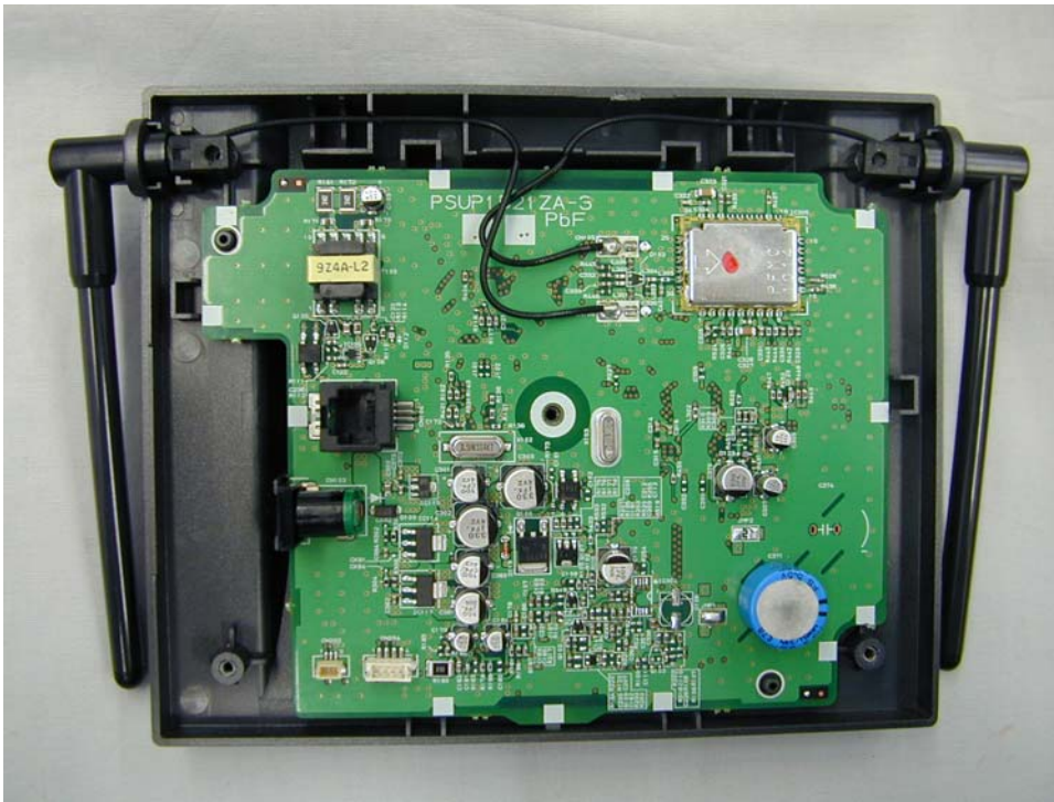
Internal view of base unit