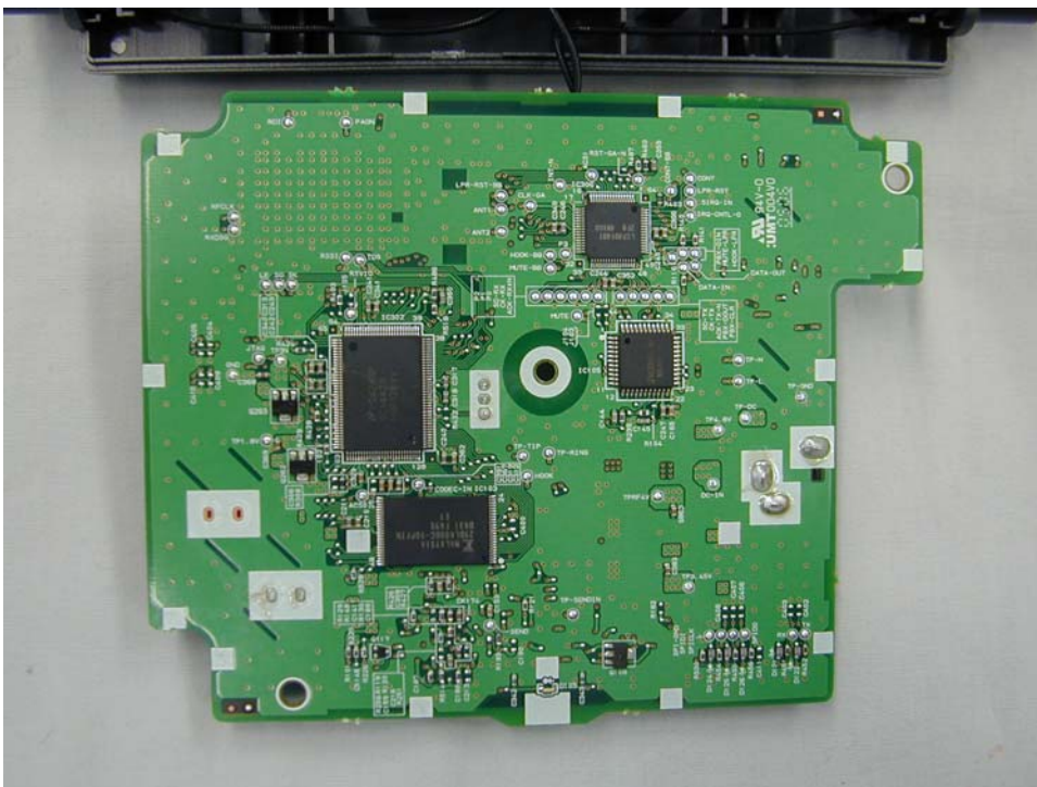
Opposite side of base unit PCB