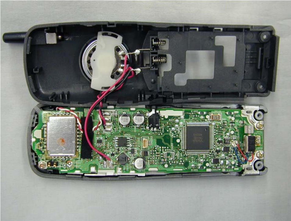
Internal view of handset