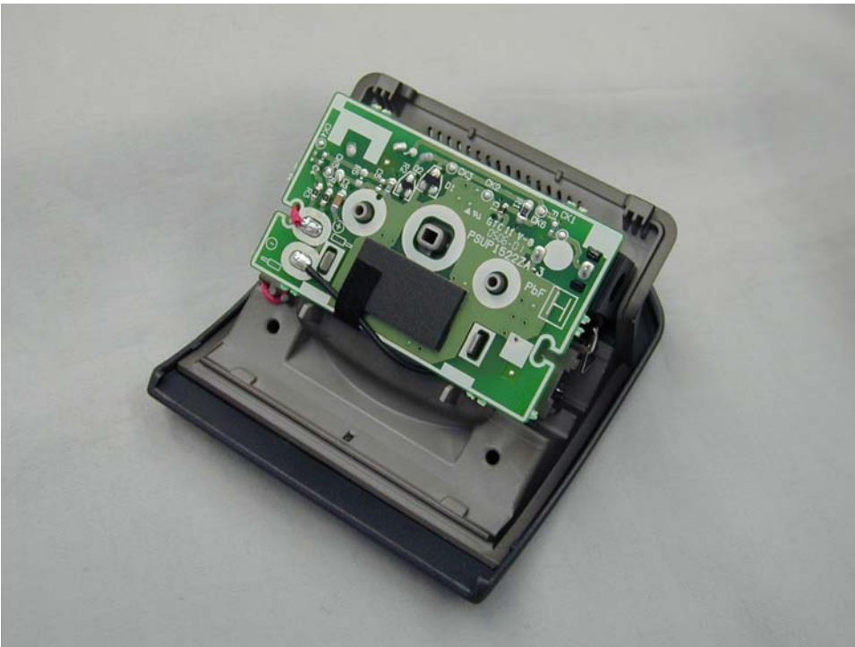
Internal view of battery charger