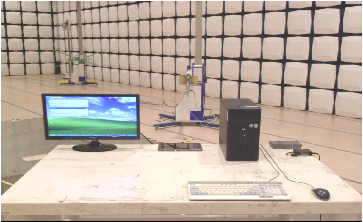
[ Radiated Disturbance for Above 1 GHz – Front ]