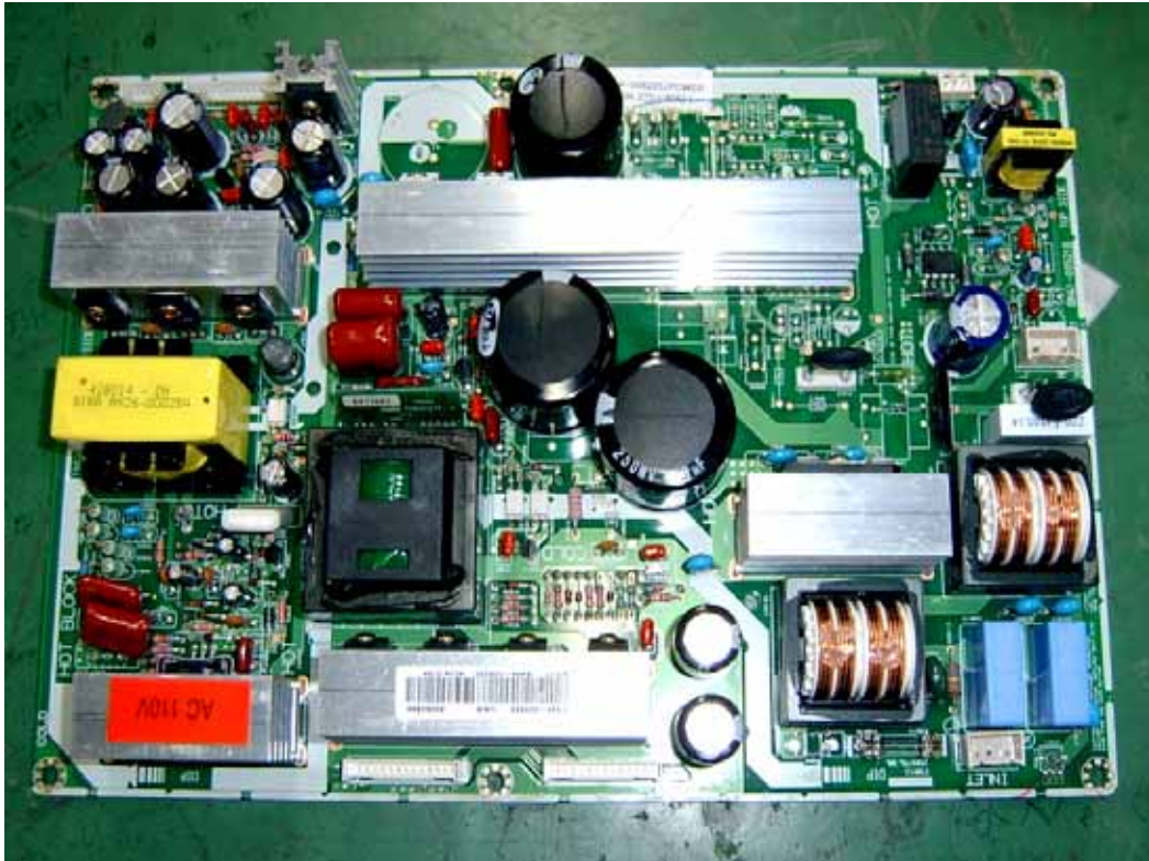
SMPS board top view