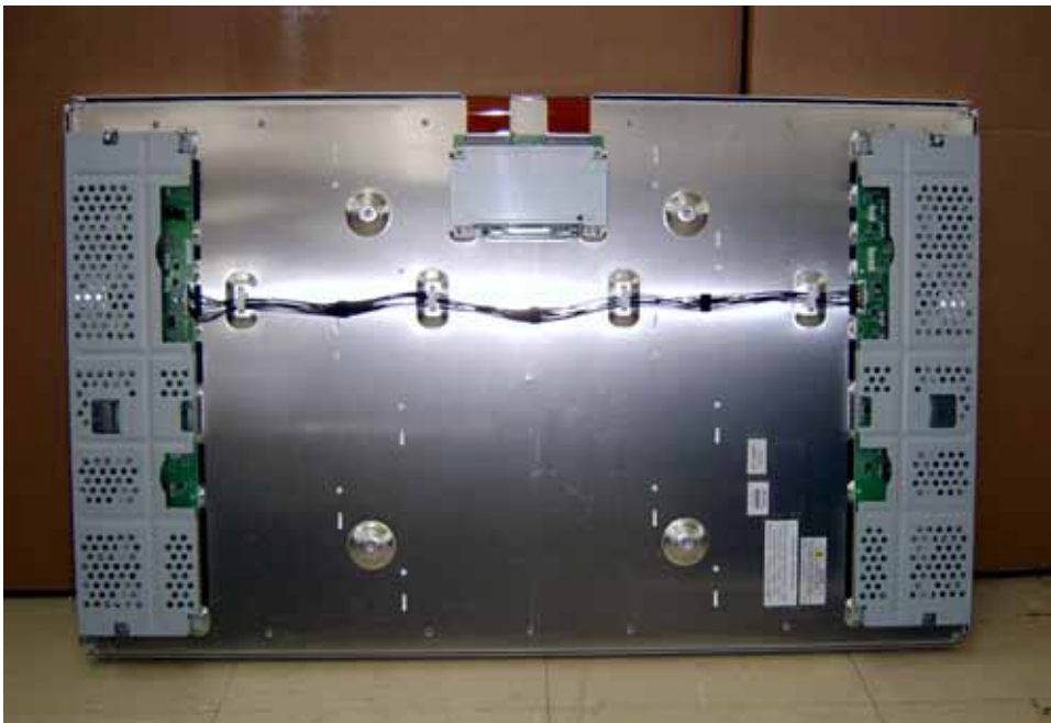
Panel rear view