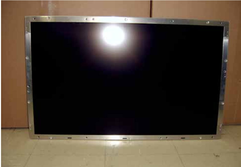
Panel front view