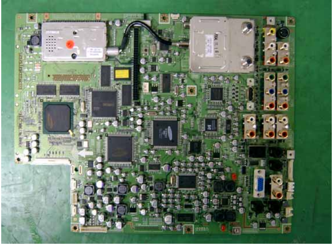
Visual board top view