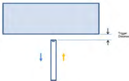
Proximity Sensor Trigger Distance Assessment KDB 616217 §6.2, Edge 1, Edge 3,

It was confirmed separately that the output power was altered according to the proximity sensor status indication. This was achieved by observing the proximity sensor status at the same as monitoring the conducted power. Section 8 contains both the full and reduced conducted power measurements.