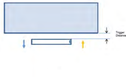
Proximity Sensor Trigger Distance Assessment KDB 616217 §6.2, Rear