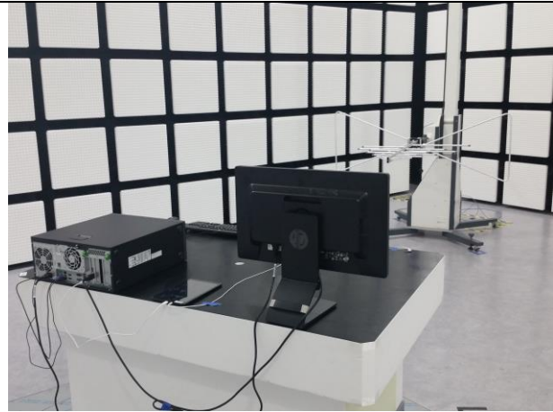
RADIATED BACK PHOTO (BELOW 1 GHz)