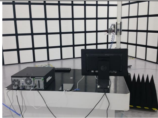
RADIATED BACK PHOTO (ABOVE 1 GHz)