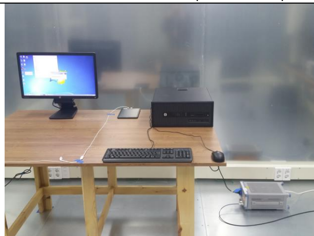
LINE CONDUCTED FRONT PHOTO