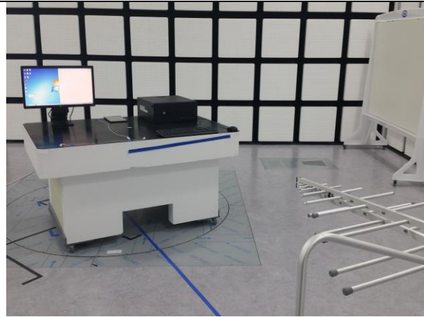
RADIATED FRONT PHOTO (BELOW 1 GHz)