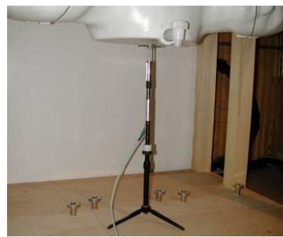
Figure A-2 System Verification Setup Photo