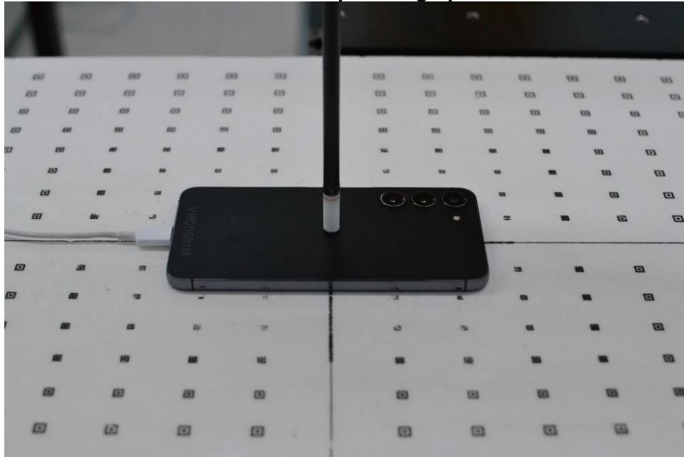
Test Setup Photo 3 – Back Side at 2 mm