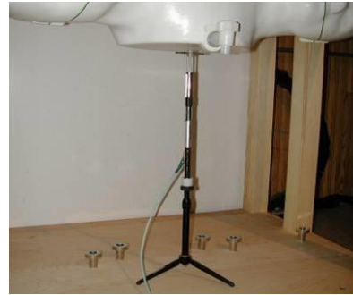
Figure A-2 System Verification Setup Photo