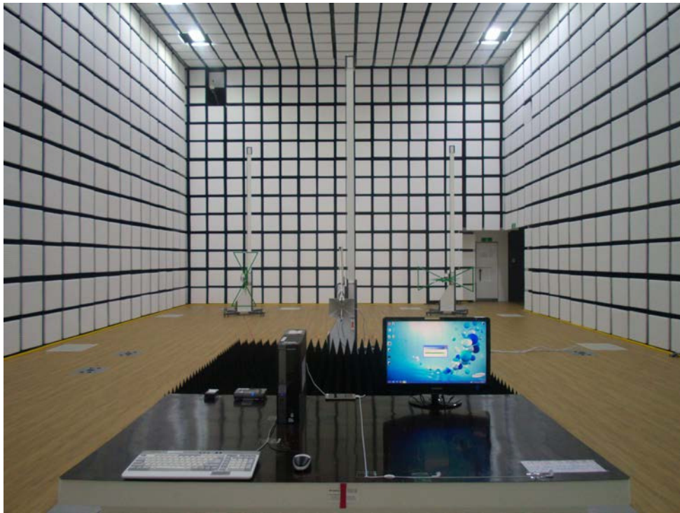
[ Radiated Disturbance for Above 1 GHz – Front ]