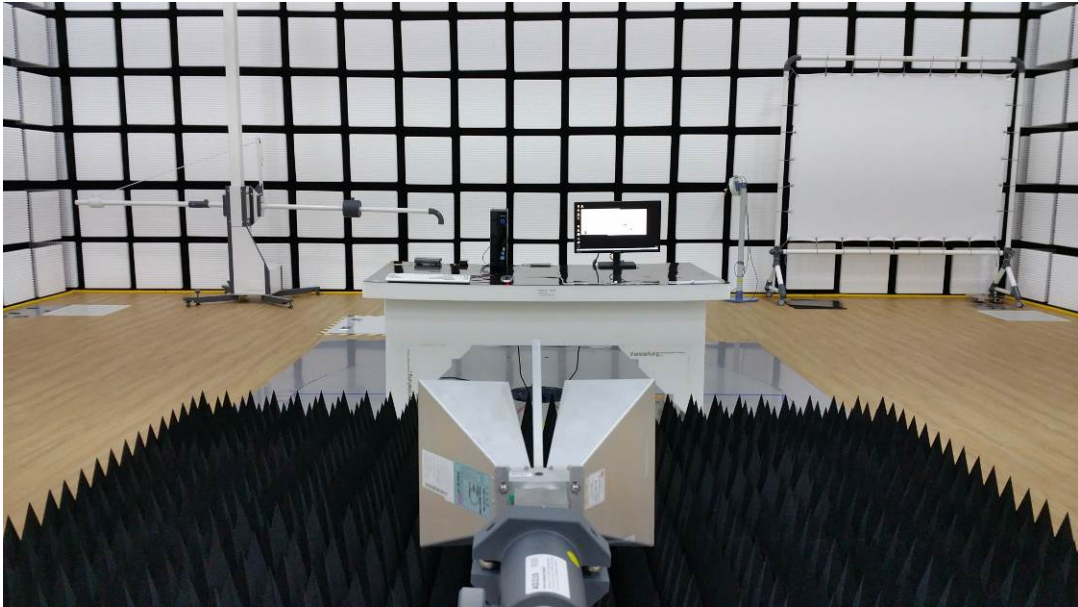
[ Radiated Disturbance for Above 1 GHz – Front ]