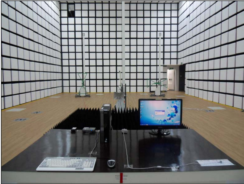
[ Radiated Disturbance for Above 1 GHz – Front ]