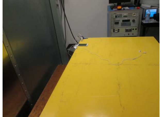
LINE CONDUCTED SIDE VIEW PHOTO