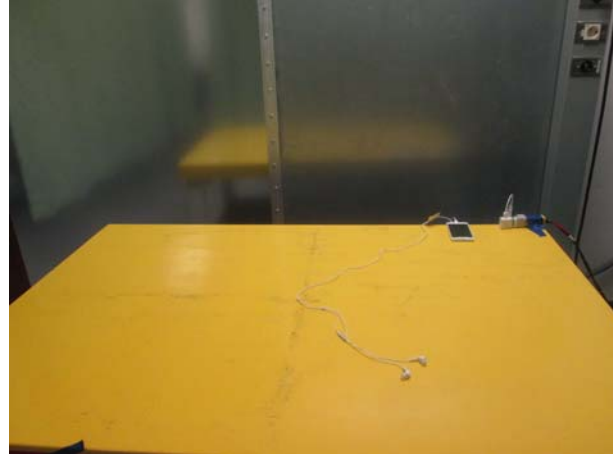
LINE CONDUCTED FRONT PHOTO