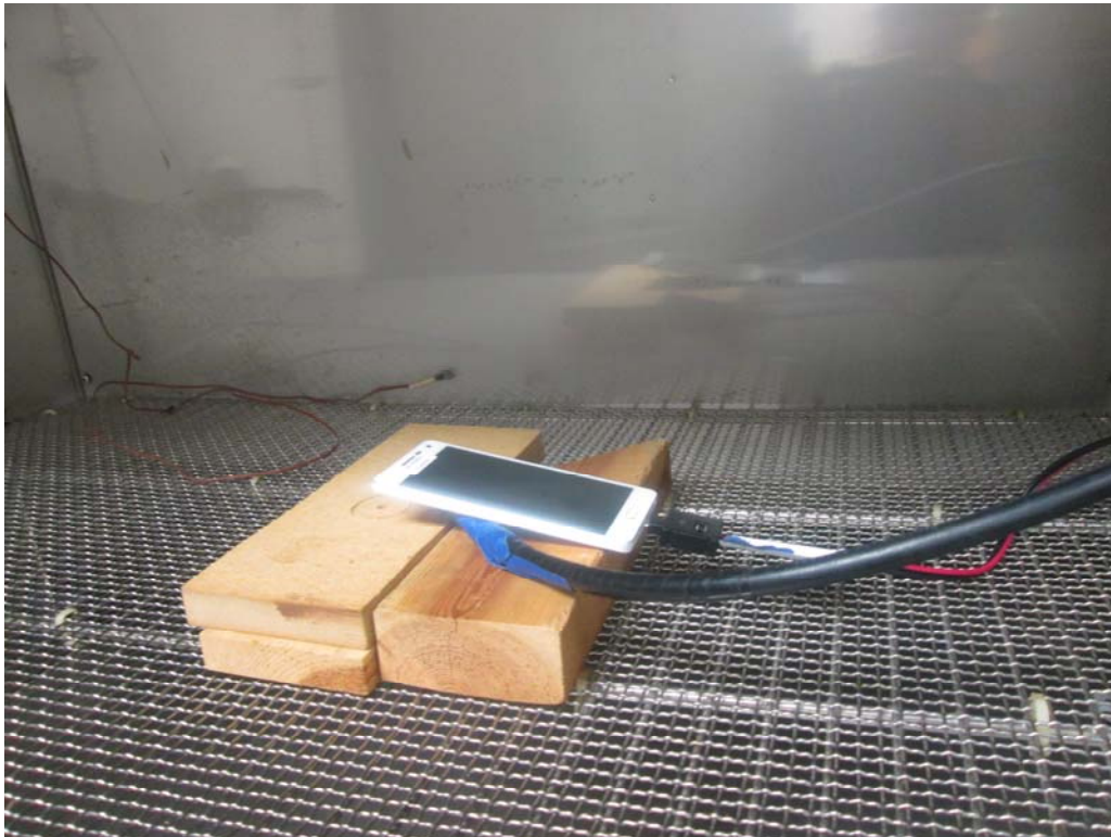
TEMPERATURE CHAMBER ENVIRONMENT