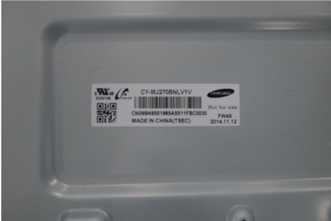
Before change MJ270BNLV1 rear view