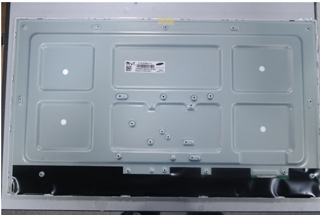
Before change MJ270BNLV1 rear view