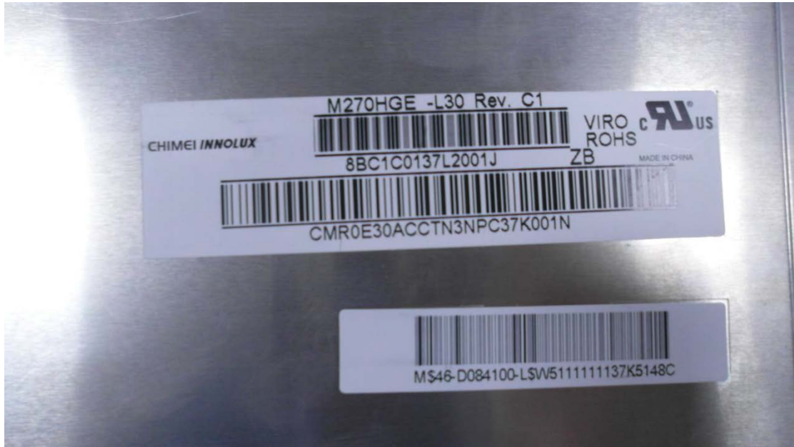
M270HGE-L30 rear view