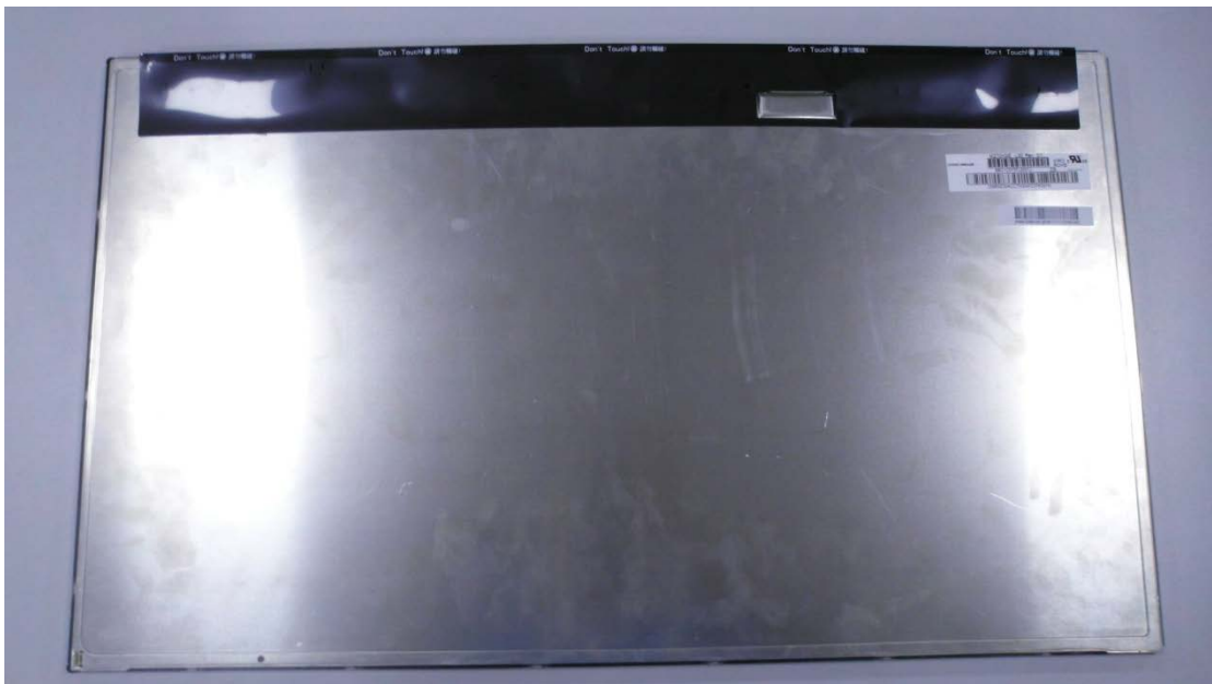
M270HGE-L30 rear view