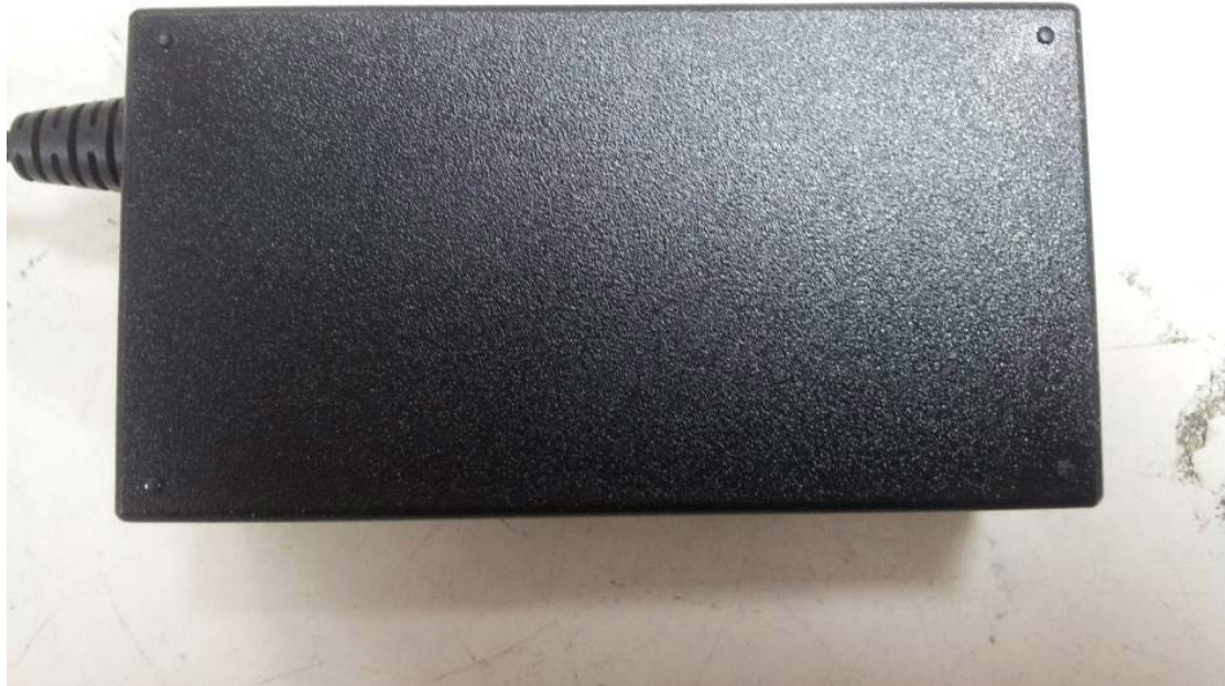
Before change A3514_DPN external rear view