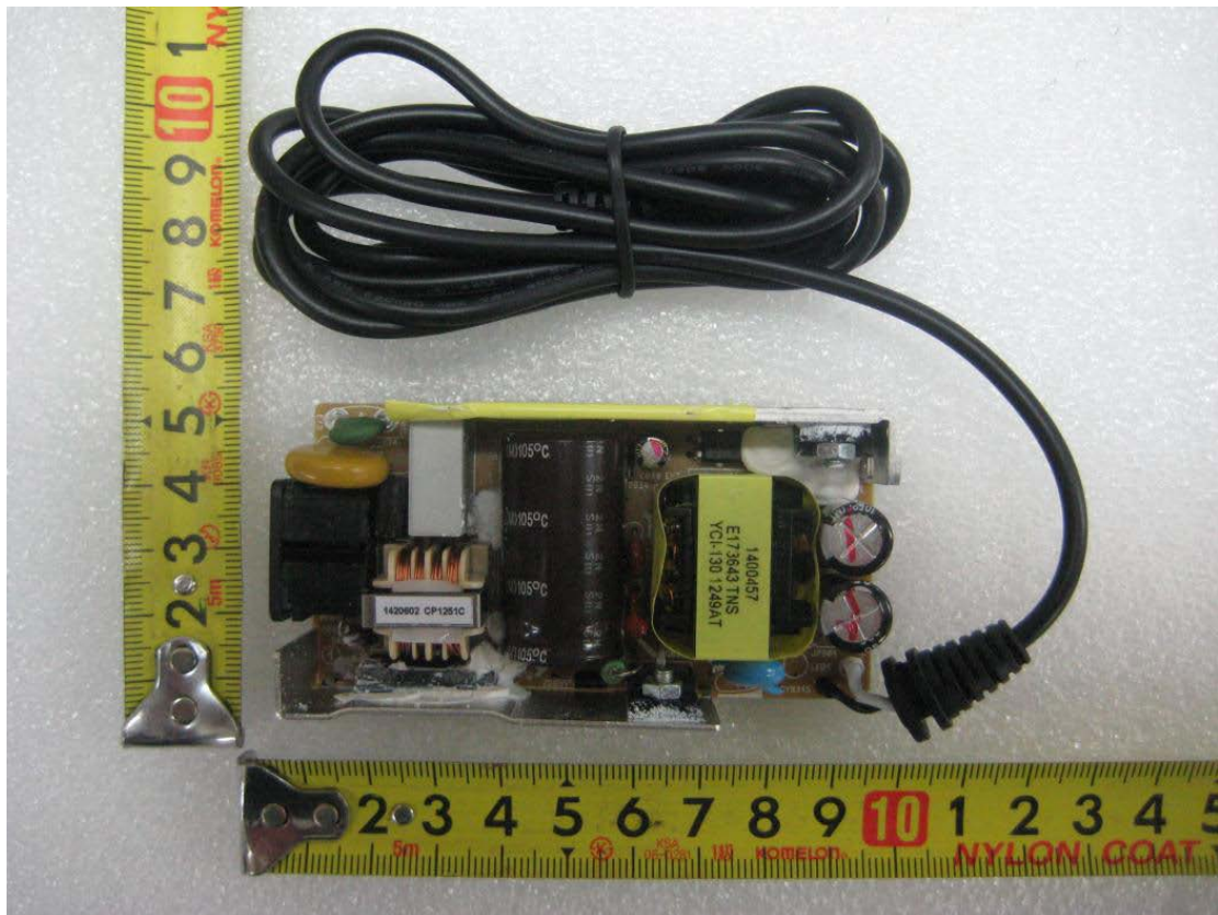
Before change A3514_DPN internal rear view