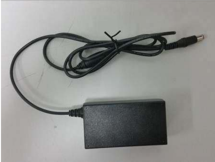
Back change A3514_FPN external rear view