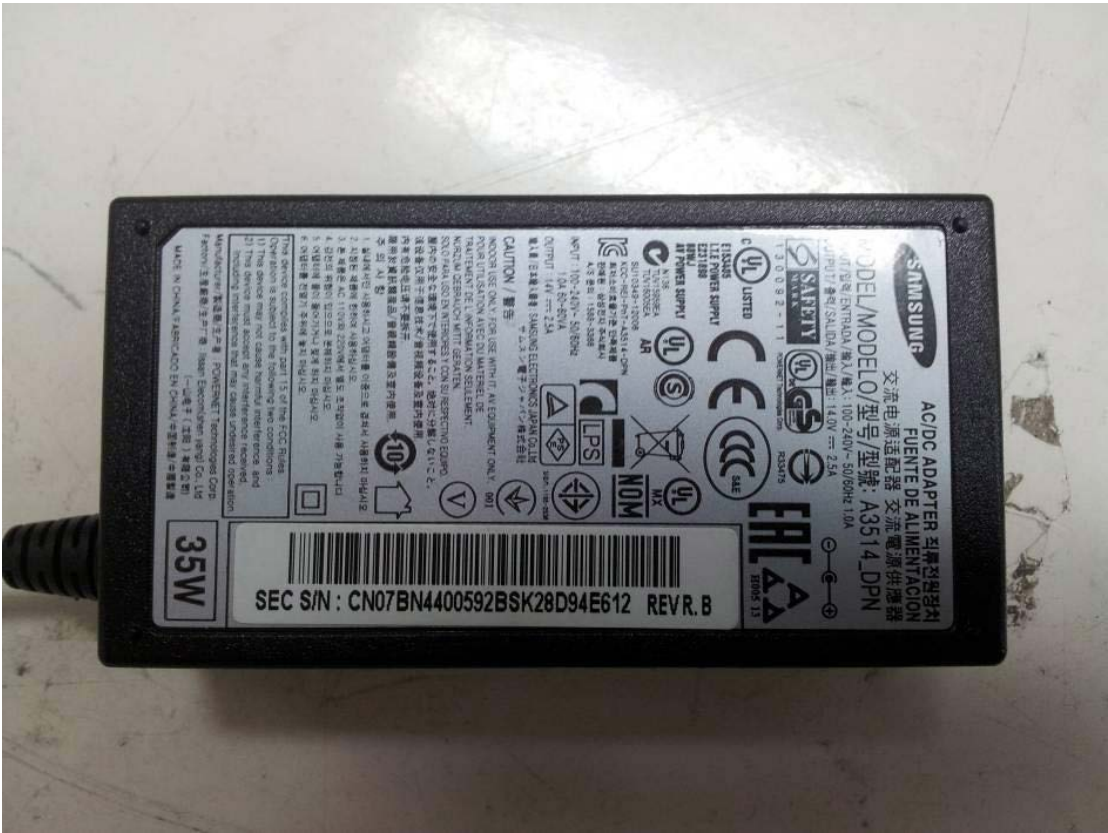
Before change A3514_DPN external front view