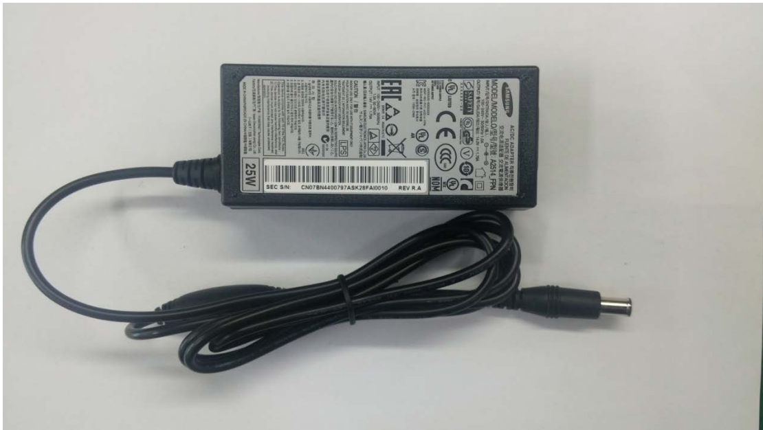
Before change A2514_FPN external rear view