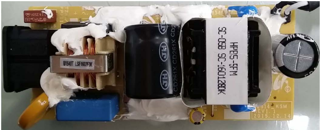
Back change A2514_KSM internal front view