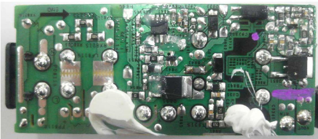
Back change A2514_KSM internal rear view