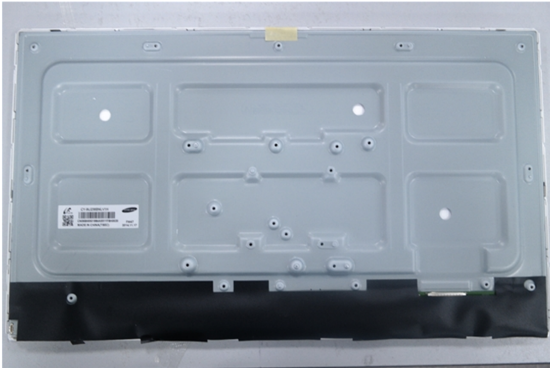
Before change MJ236BNLV1 rear view