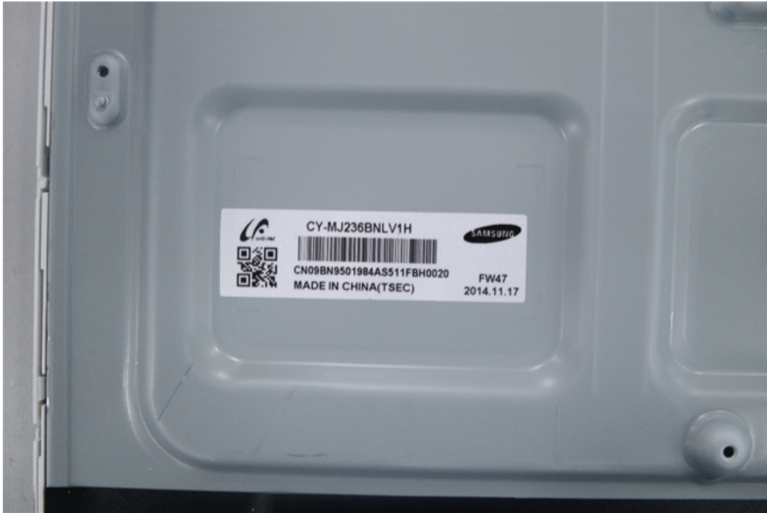
Before change MJ236BNLV1 rear view