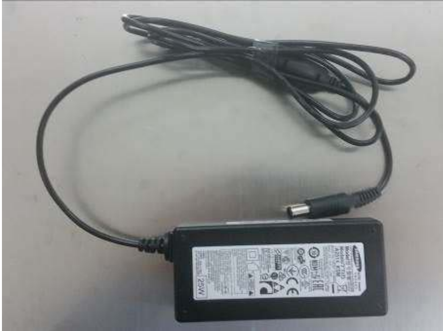
Back change A2514_KSM external front view