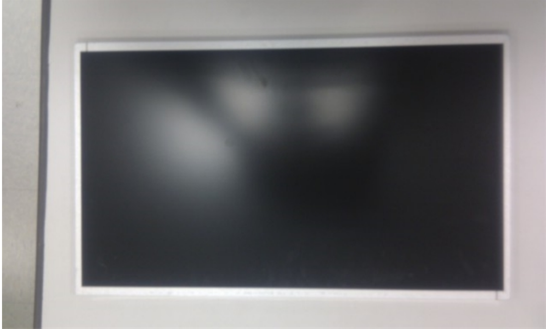
Before change MJ236BNLV1 front view