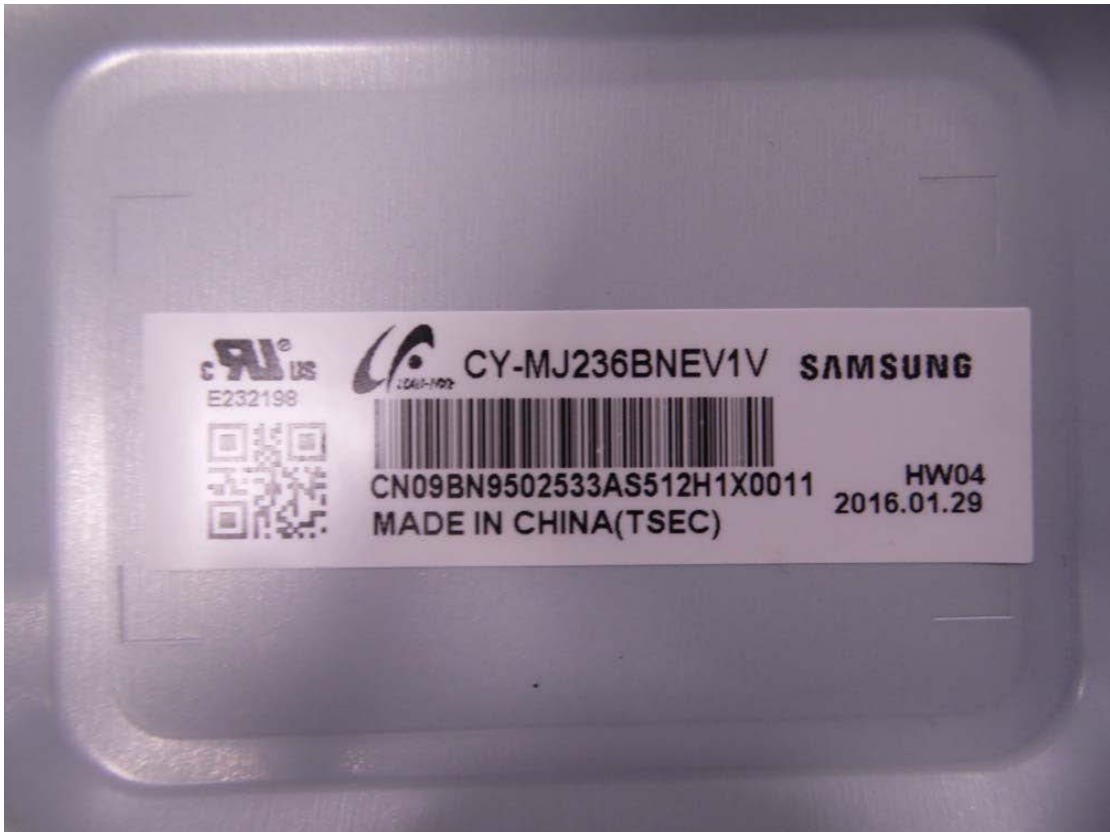
Back change CY-MJ236BNEV1 rear view