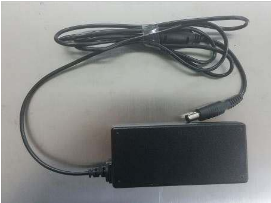
Back change A2514_KSM external rear view