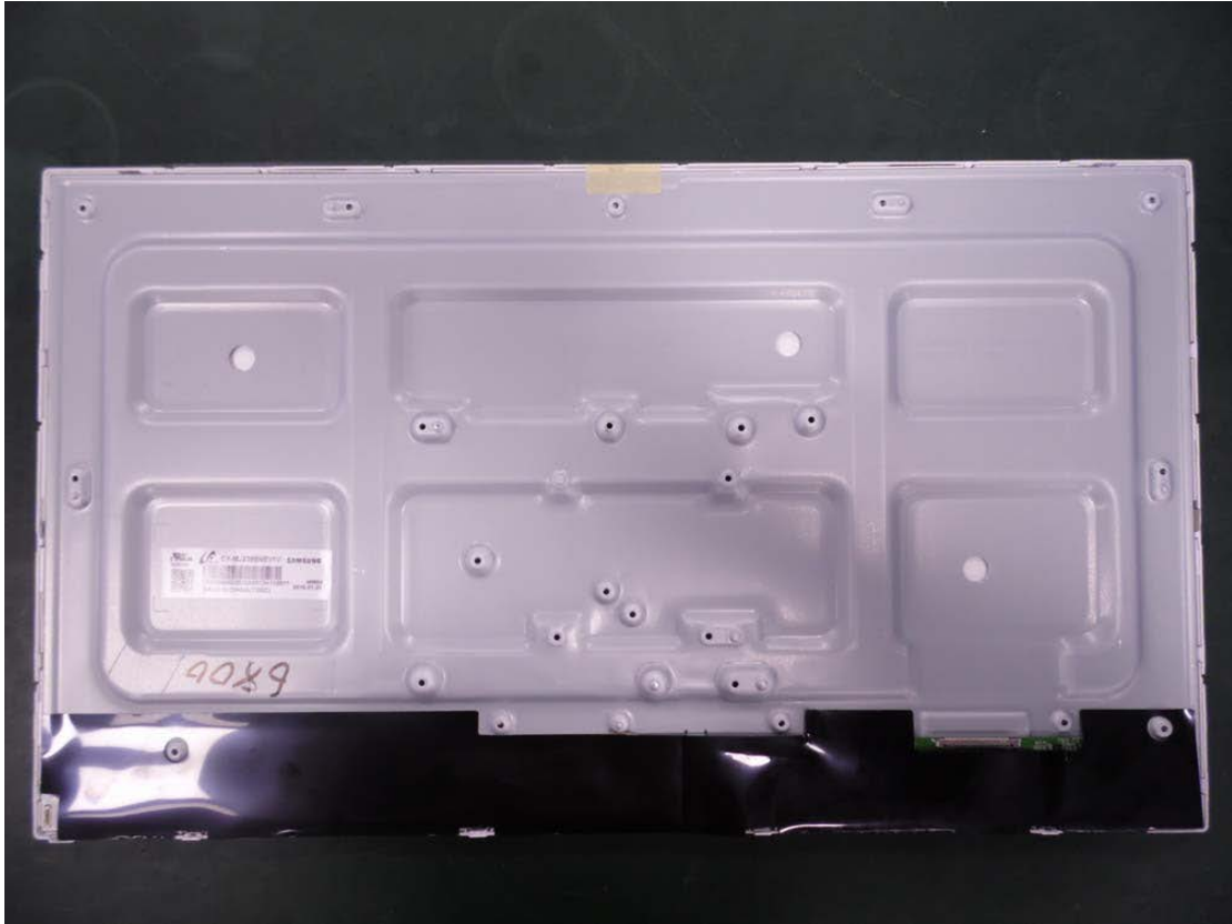
Back change CY-MJ236BNEV1 rear view