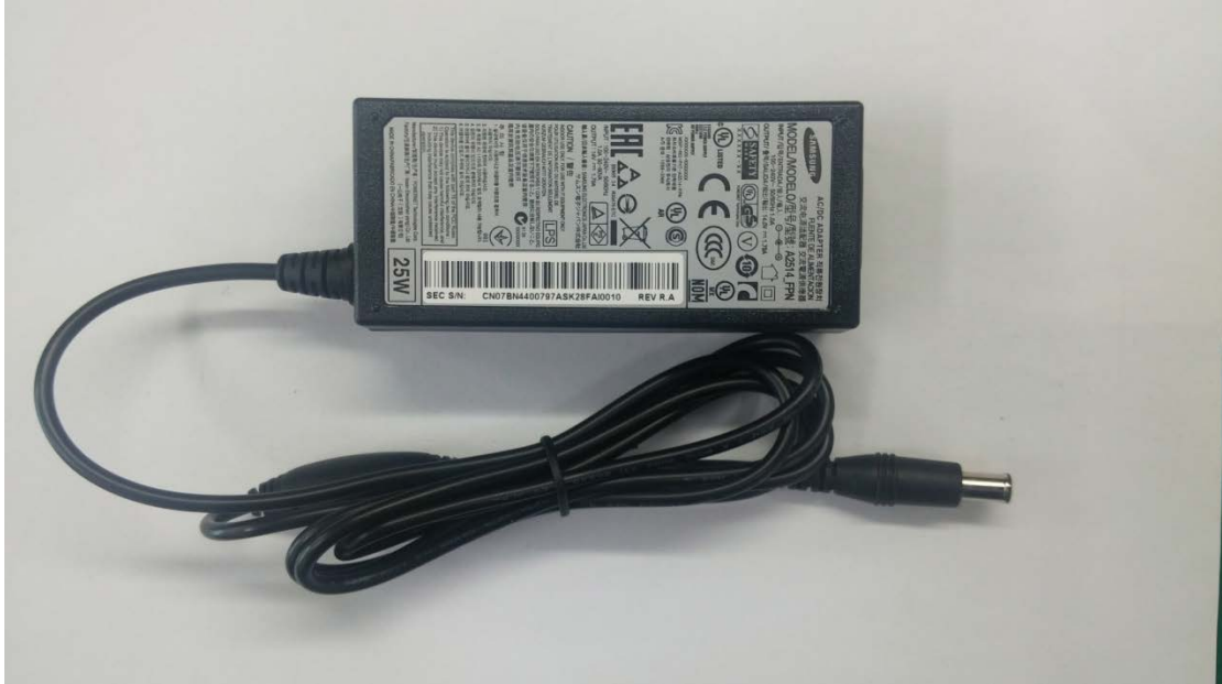
Before change A2514_FPN external rear view