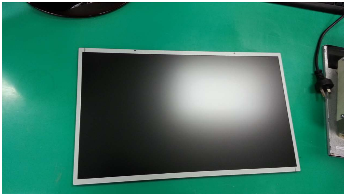
Before change HR215WU1-200 front view