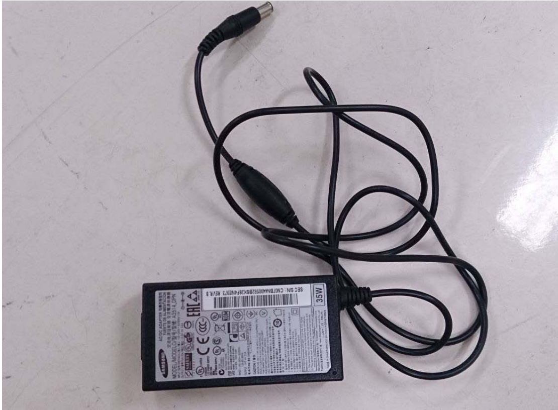
Before change A3514_DPN external front view