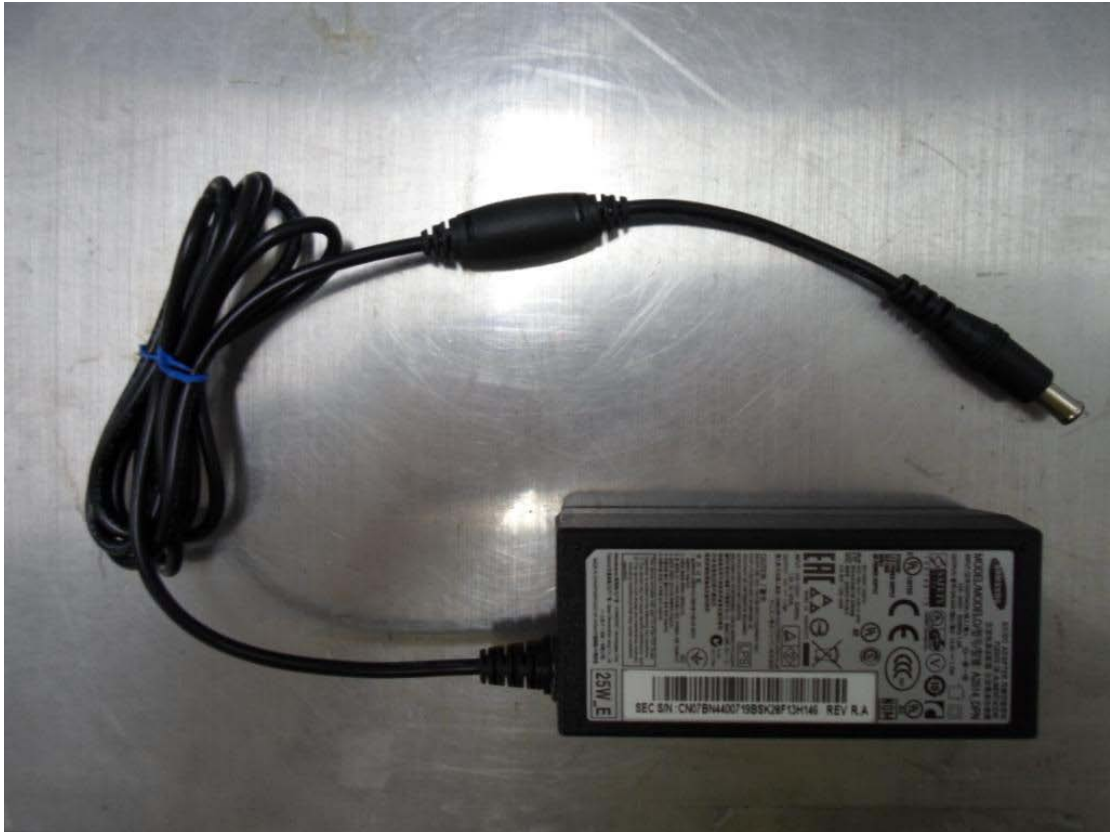
Before change A2514_DPN external front view