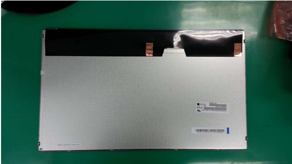
Before change HR215WU1-200 rear view