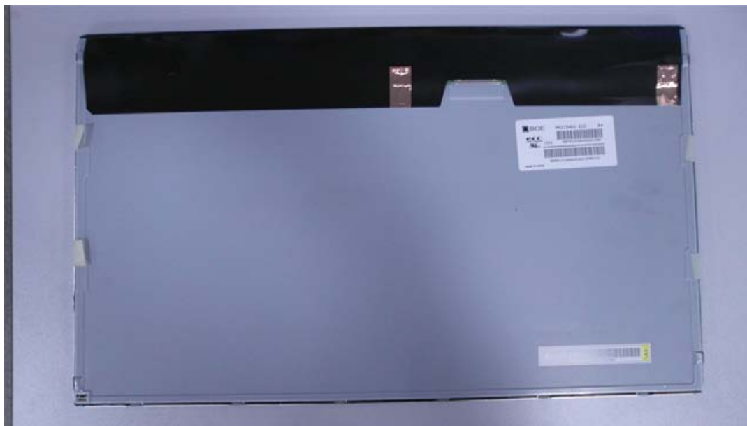
Before change HR215WU1-210 rear view