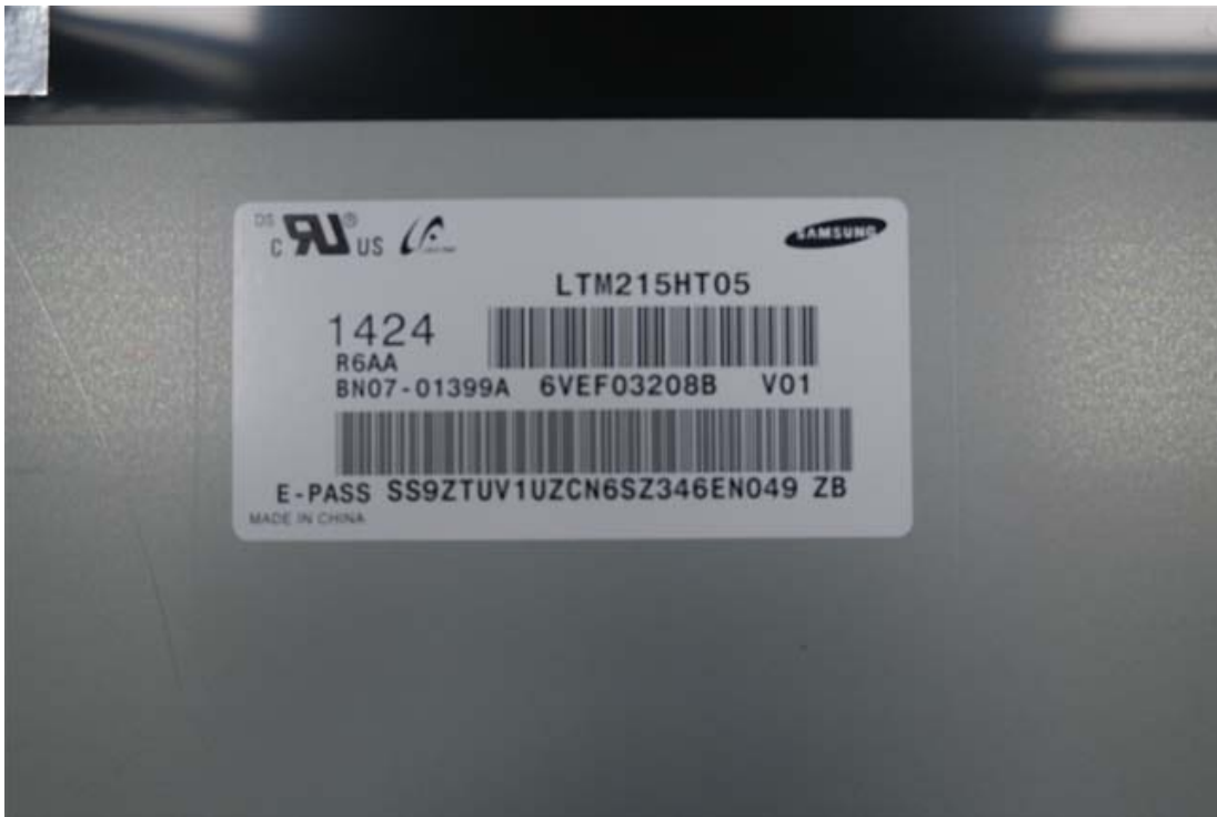
Back change LTM215HT05 rear view