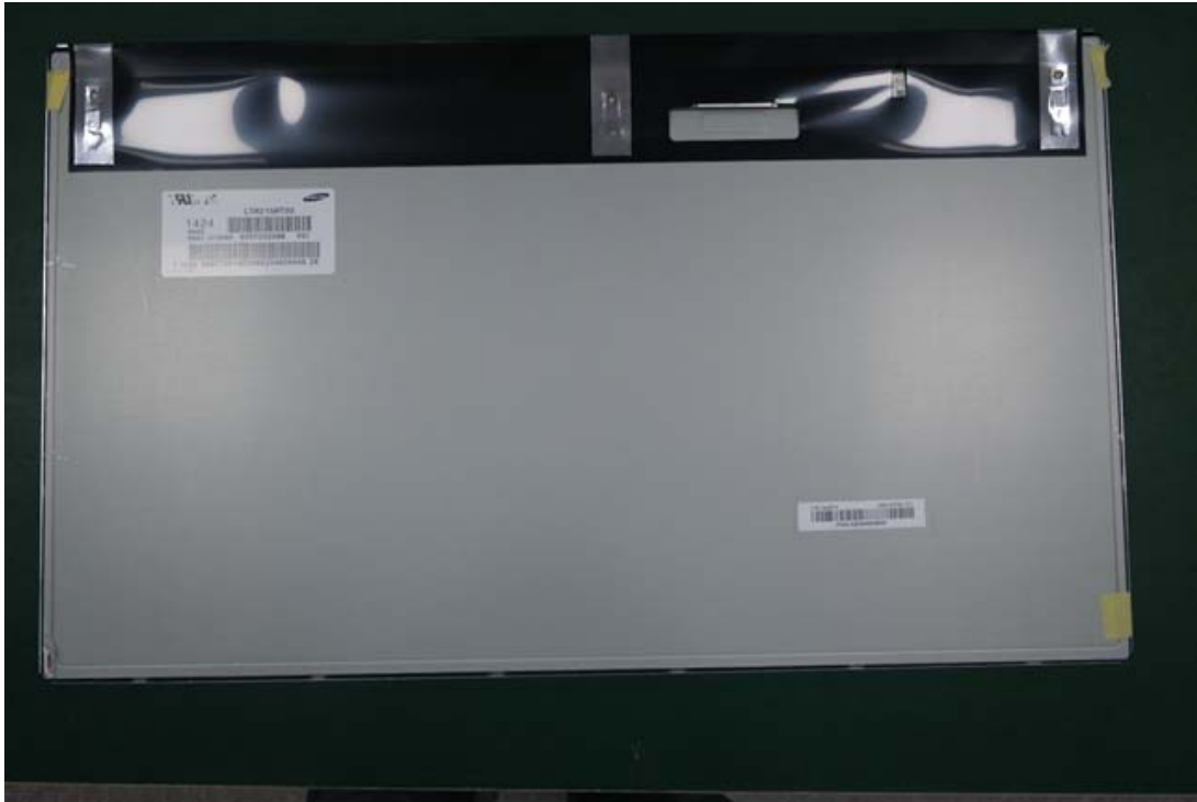
Back change LTM215HT05 rear view