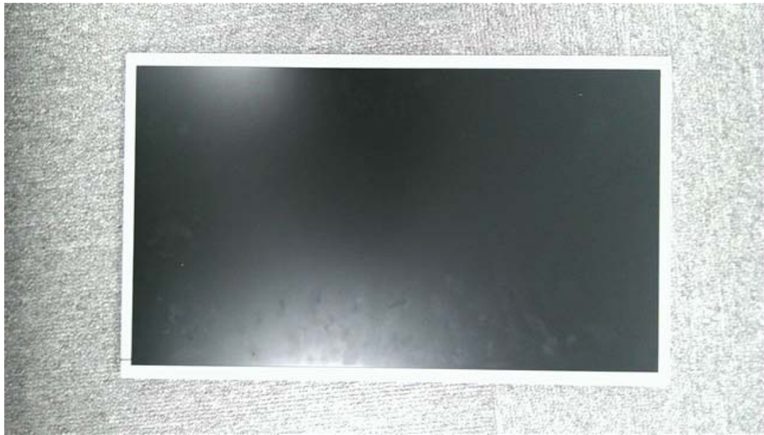
Back change LTM215HT05 front view