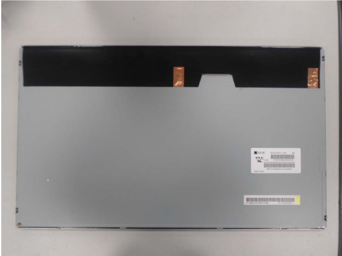
Before change HT215F01-100 B4 rear view