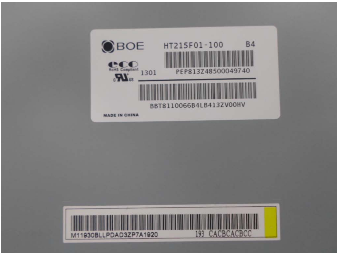
Before change HT215F01-100 B4 rear view