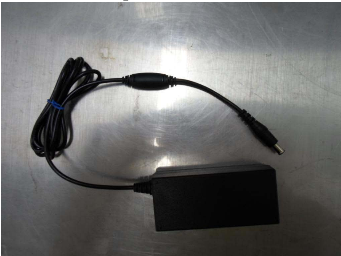
Before change A2514_DPN external rear view