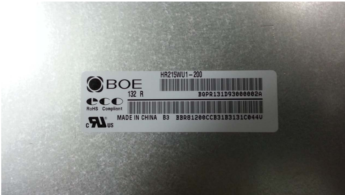
Before change HR215WU1-200 rear view