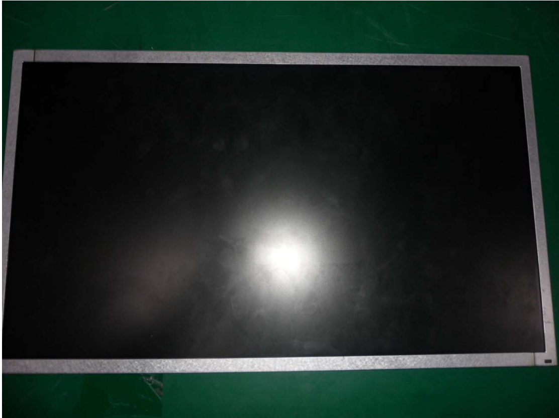
Before change M215HTN01.1 front view