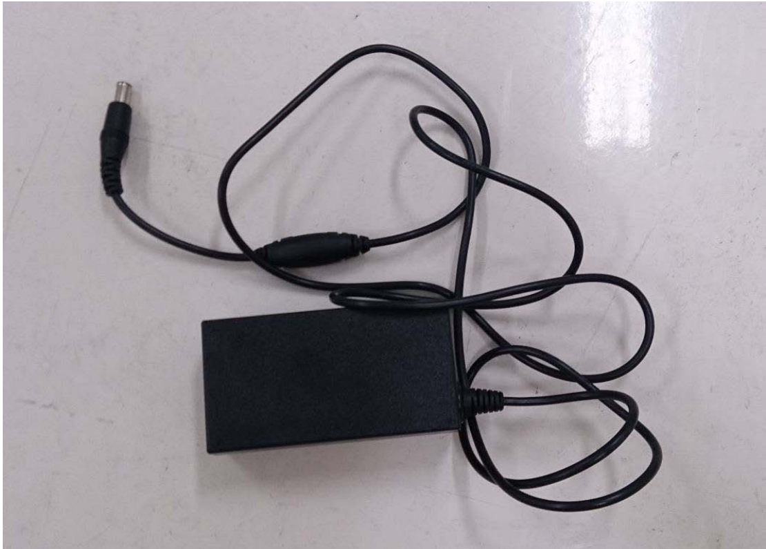
Before change A3514_DPN external rear view