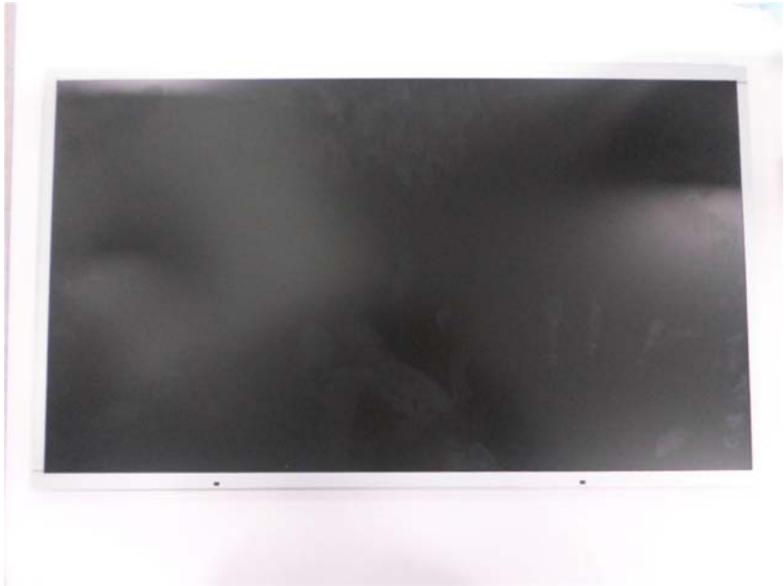
Before change HR215WU1-210 front view