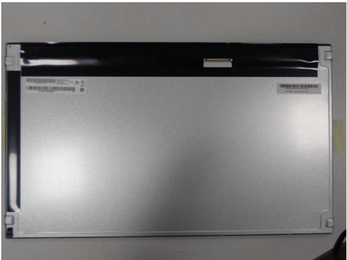
Before change M215HTN01.1 rear view