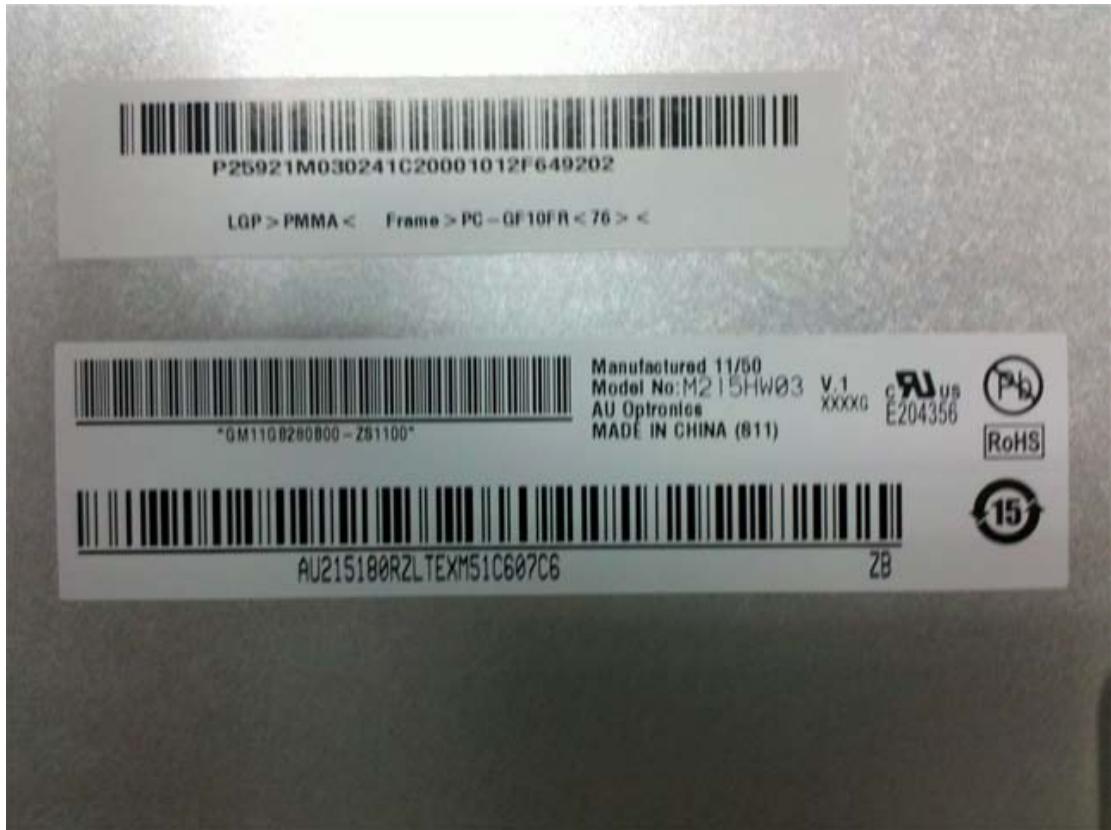
Before change M215HW03 rear view