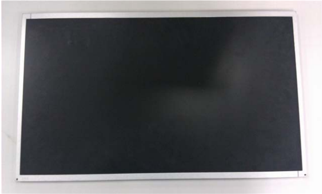
Before change M215HW03 front view