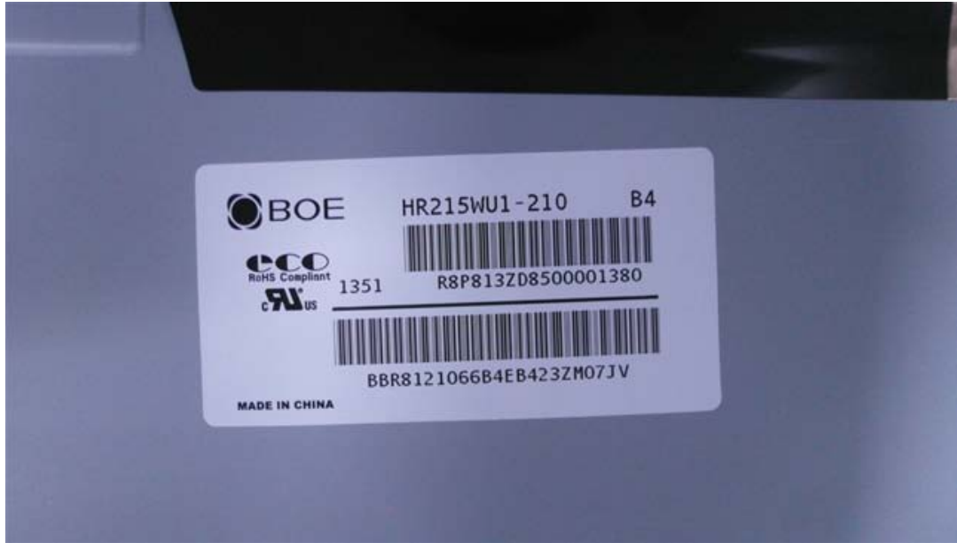
Before change HR215WU1-210 rear view