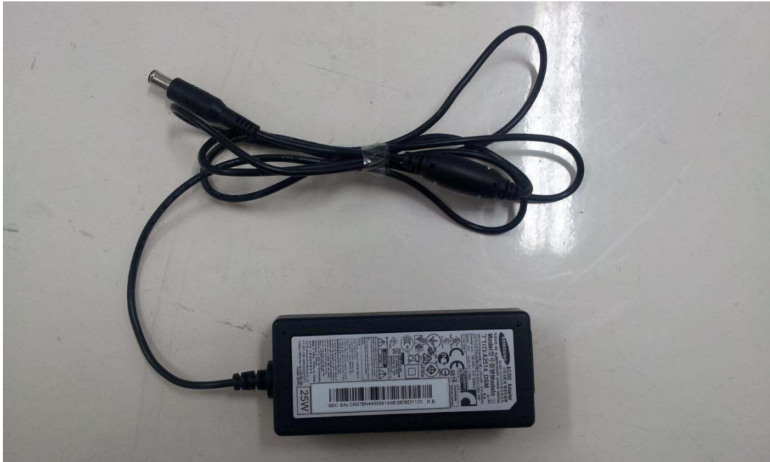
Back change A2514_DSM external front view