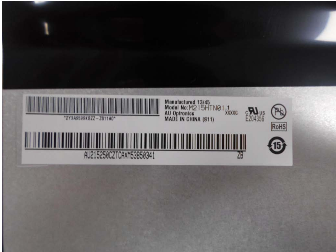
Before change M215HTN01.1 rear view