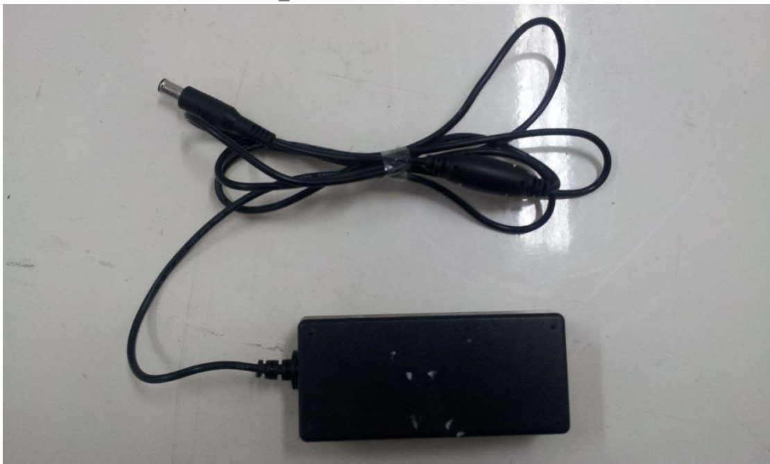
Back change A2514_DSM external rear view