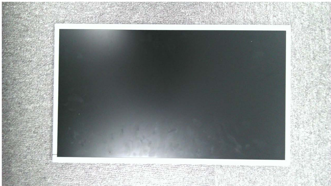
Before change HT215F01-100 B4 front view