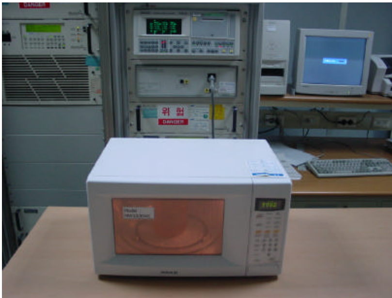
Fig.3 Test Setup for RF output power

The Caloric Method was used to determine maximum output power. The initial temperature of a 1000-ml water load was measured. The water load was placed in the center of the oven. The oven was operated at maximum output power for 120 seconds. Then the temperature of the water re-measured.