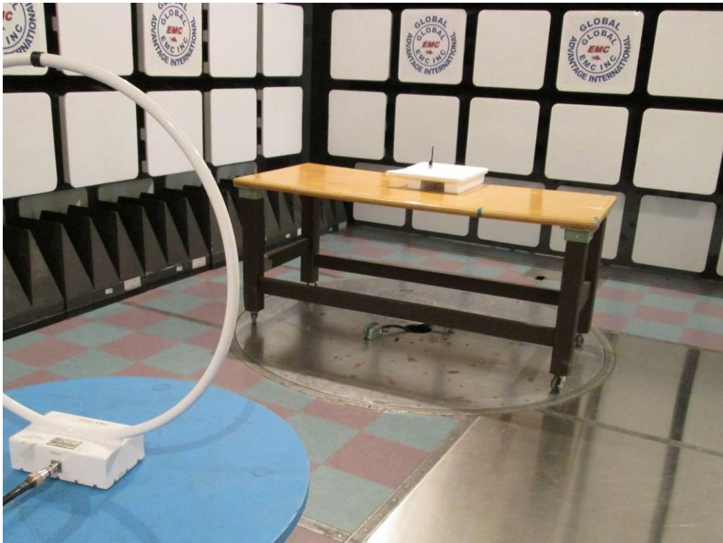
Radiated Emissions Photo 1