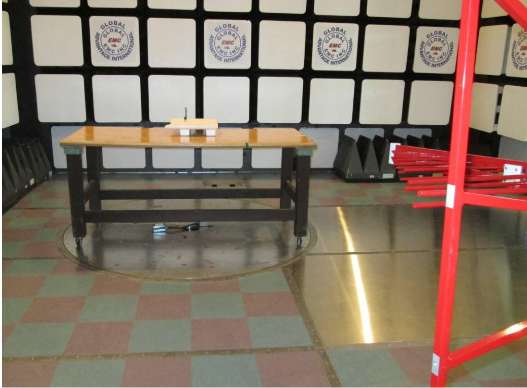
Radiated Emissions Photo 2