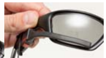
Boom Outside Lens