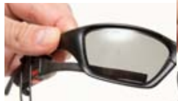
Boom Inside Lens