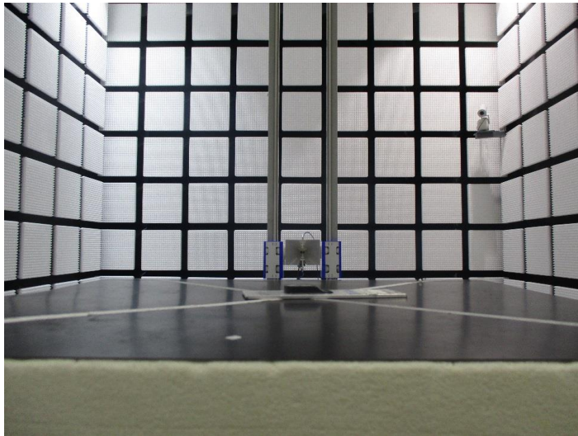
Radiated Emission (above 1GHz)