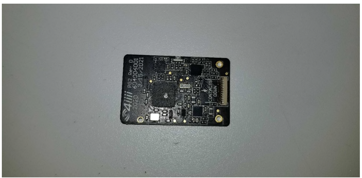
Figure 2 – EUT Internal Photo Back