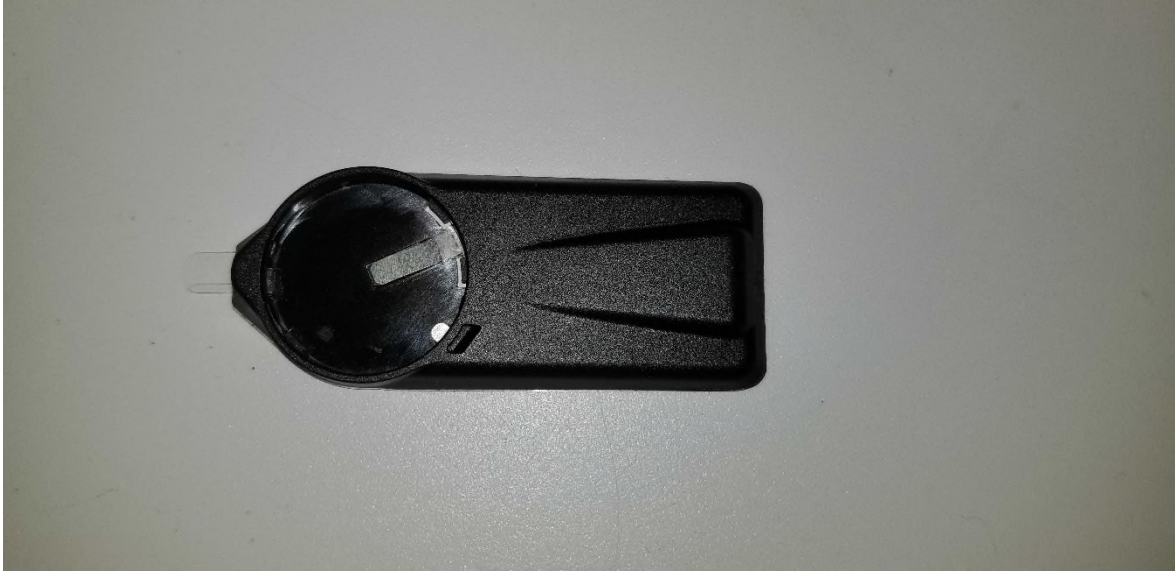
Figure 1 – EUT External Photo Front Close Up