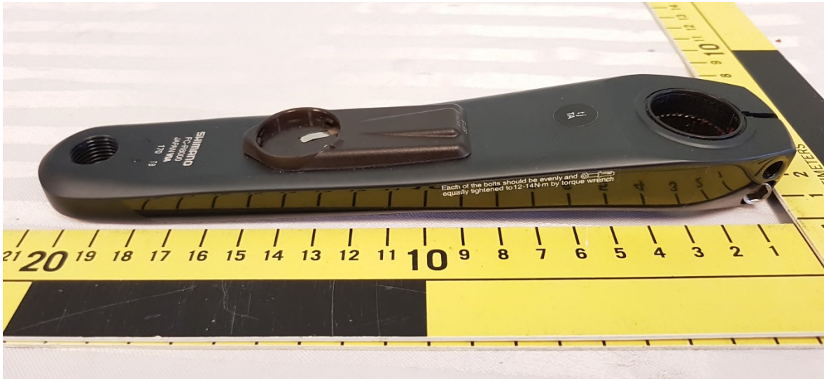
Figure 2 – EUT External Photo Side