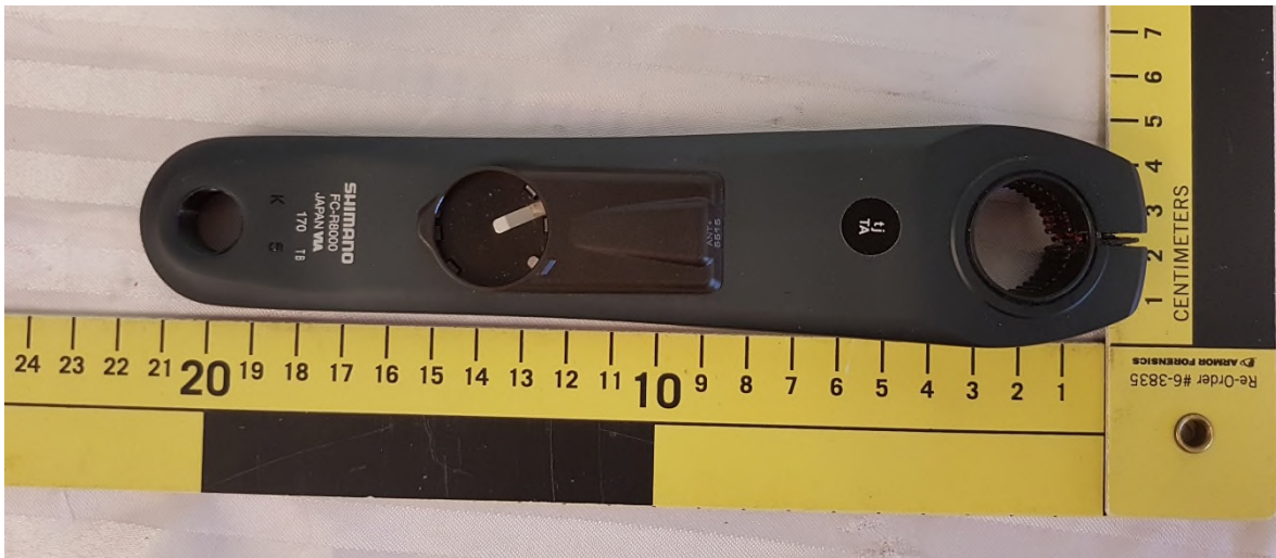
Figure 2 – EUT External Photo Front