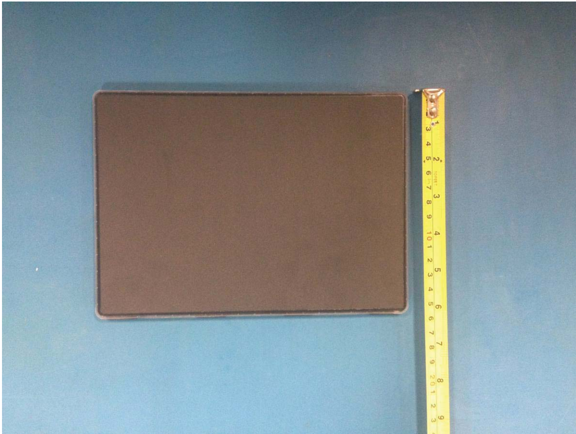
Figure 3: External Photo of Battery Pack (Top)