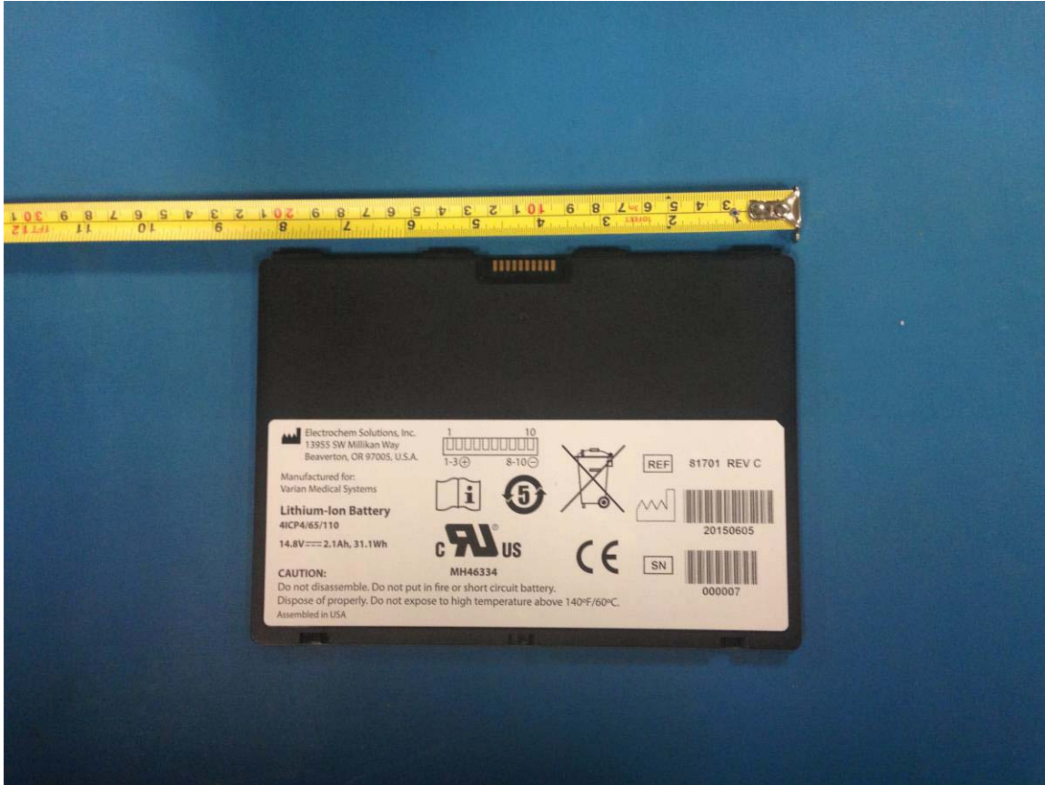
Figure 4: External Photo of Battery Pack (Bottom)