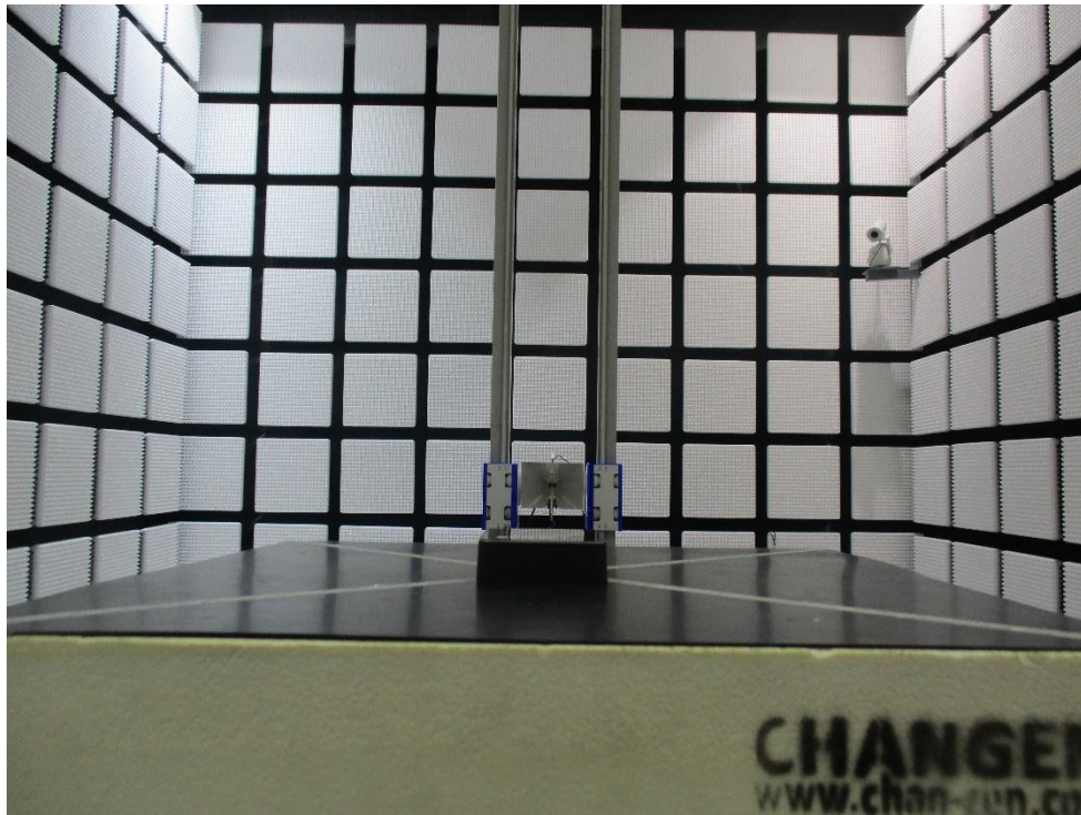
Radiated Emission Test above 1GHz