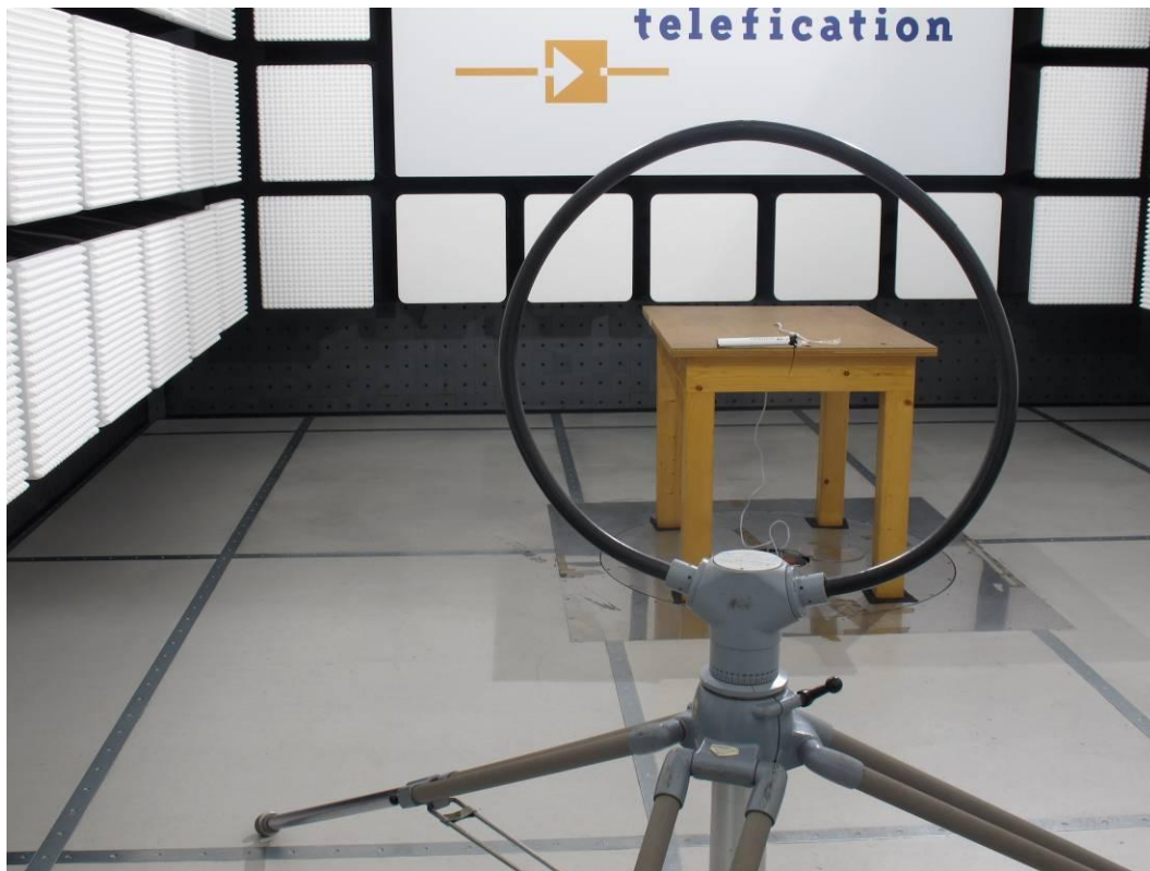
Photograph 1: Test setup radiated emissions (0.15 - 30 MHz)