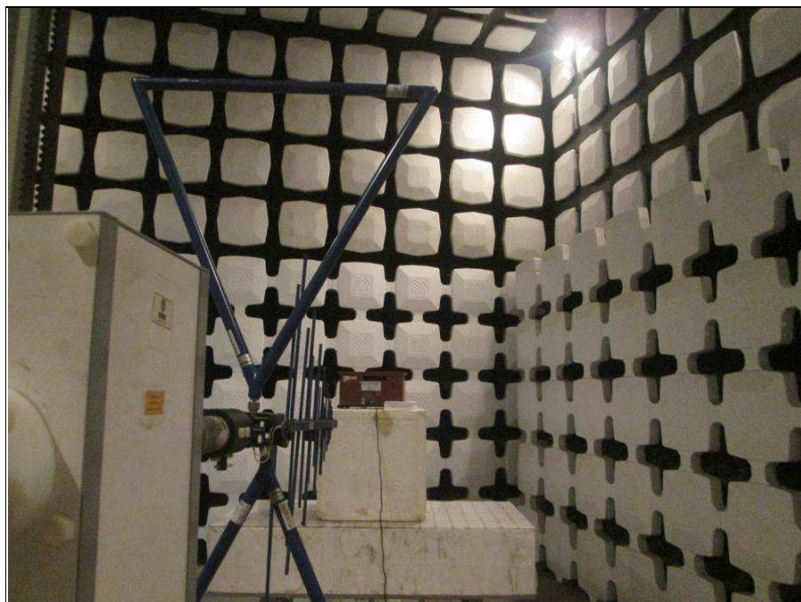
Frequency Range< Above 1GHz >