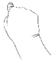
Press and Hold