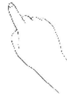
Drag & Drop