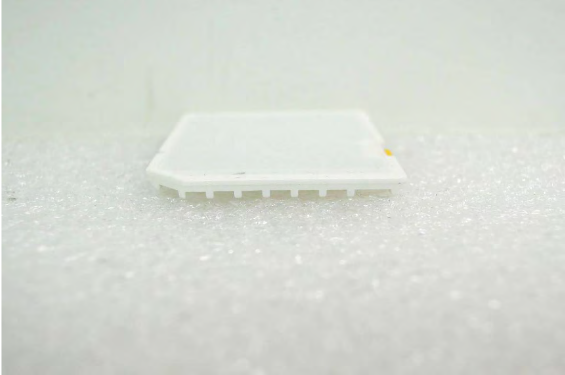
Side View of EUT-4 (16GB)