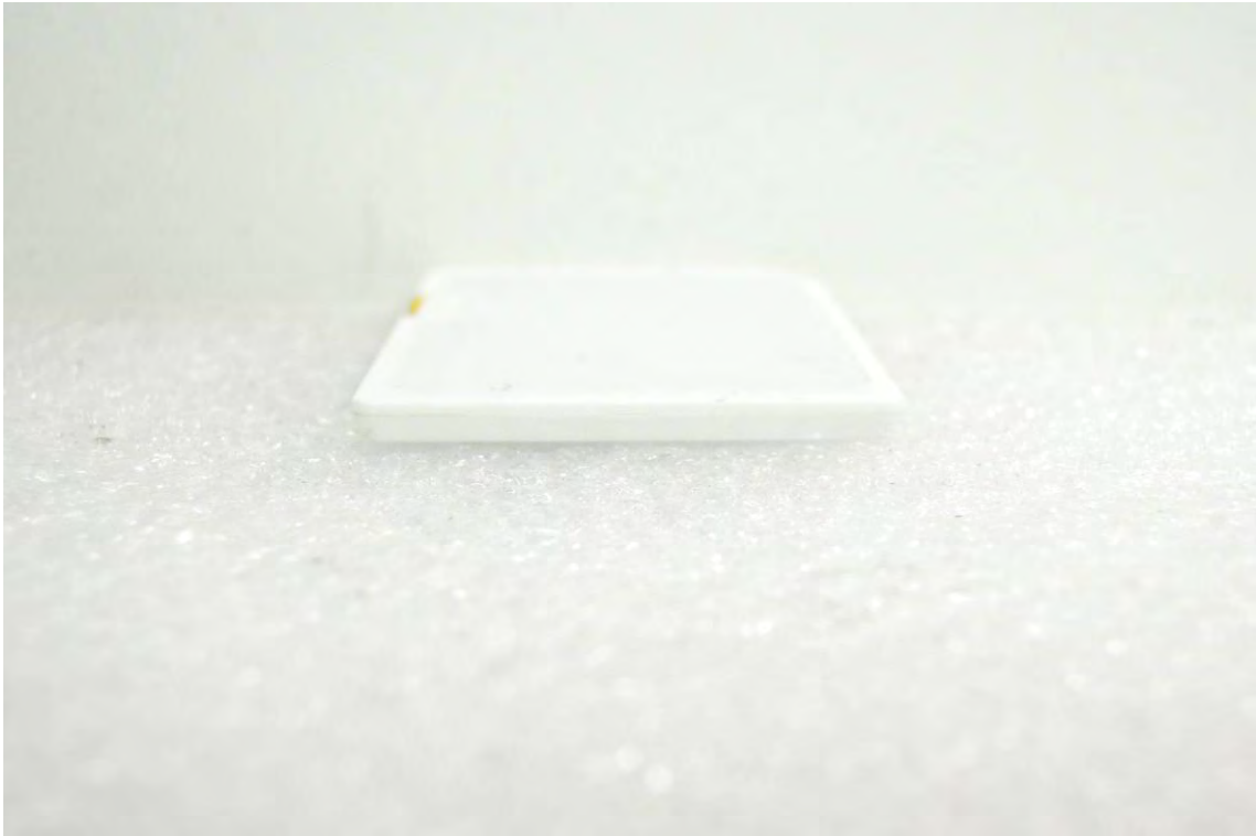
Side View of EUT-2 (16GB)