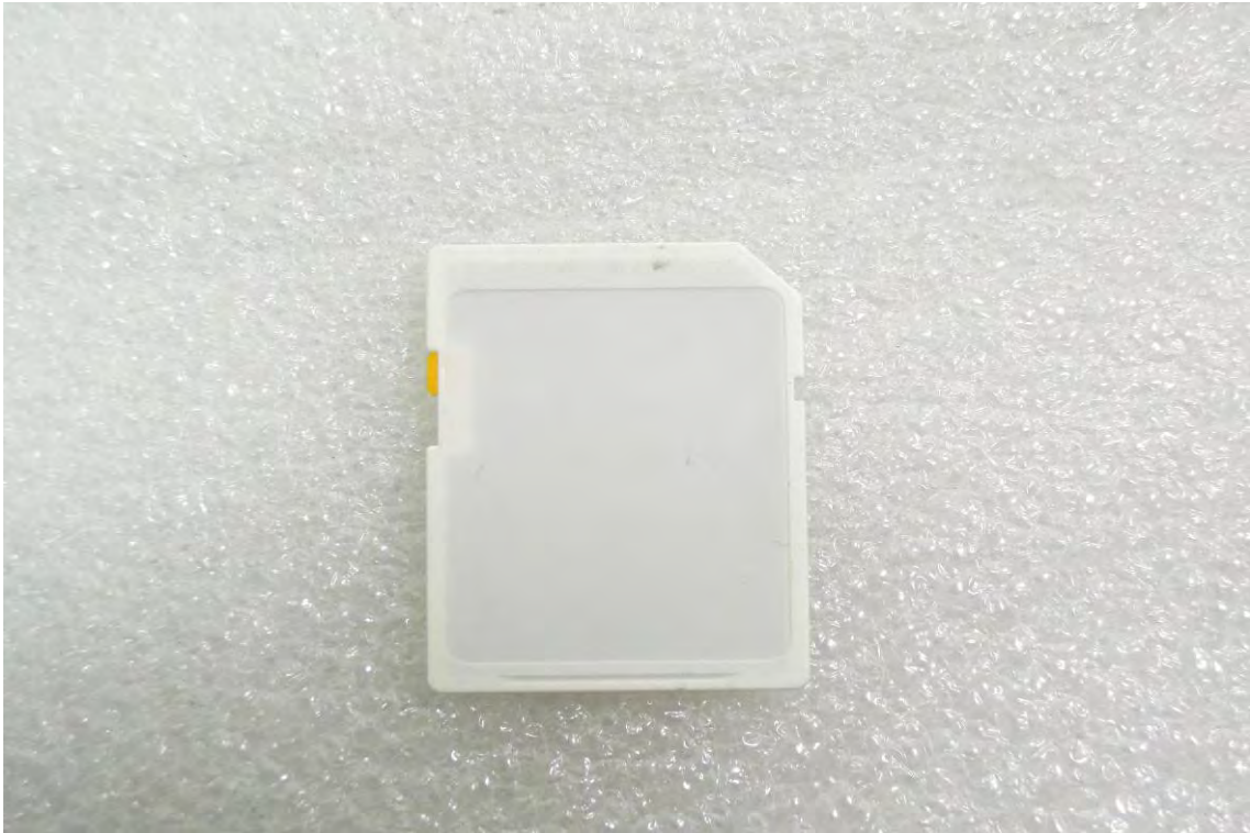
Back View of EUT (8GB)