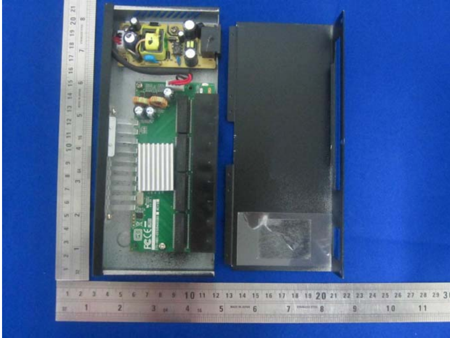
EUT – Main Board Top With Radiator View