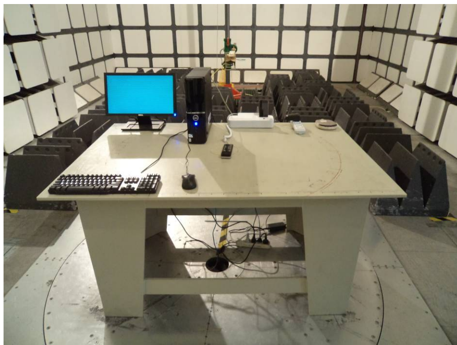
Radiated Emissions – Rear View (Above 1 GHz)